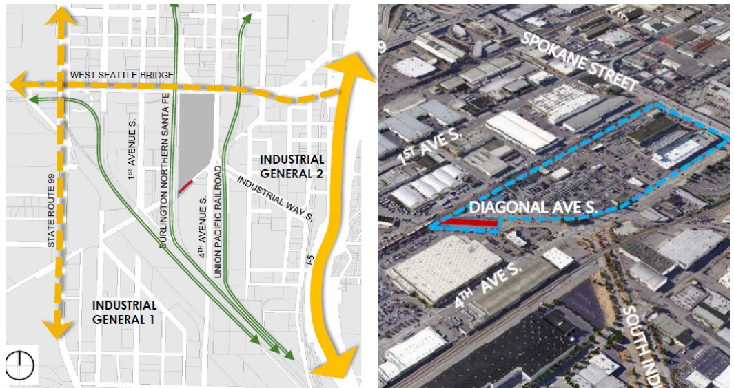
Image 1: Project location (highlighted in dark gray & red on left and blue & red on right)