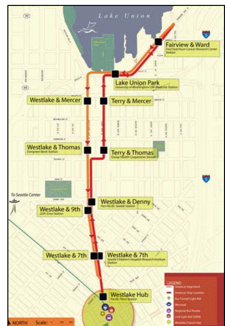
South Lake Union Streetcar Line

Pedestrian and Streetscape Improvements: The Westlake Hub includes intermodal connections between the Monorail, buses,