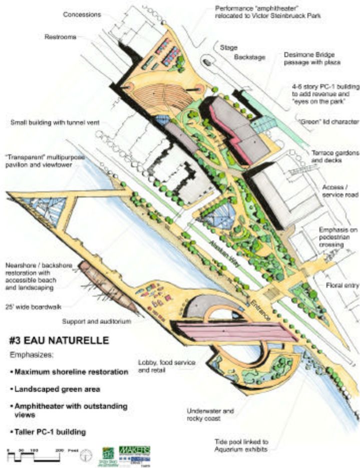
Concept Alternative #3: Eau Naturelle