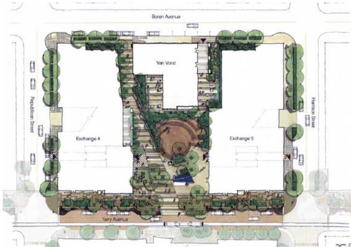
Interurban Exchange IV/V Concept Design

Right now biotech demand is not huge, believe that it will increase in 2006 our goal is to start as early as June 2006 but will depend on when we get tenant late start June 2007 finished in construction to 2010 and 2011.