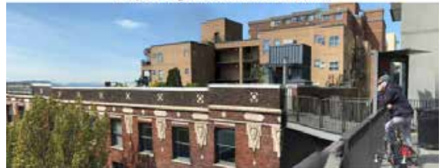
Figure 1: Location of existing skybridge

The project team is proposing a public benefit package that includes upgrading lighting and wayfinding signage along Post Alley, a historic marker on the Marketside Flats building facade, and coordination with the Office of the Waterfront to provide intersection improvements near Union Street and Western Ave (see figure 2).