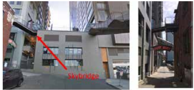
Sky-bridge From Union Street