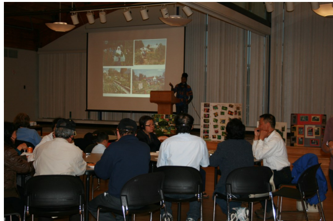
New Holly Youth & Family design meeting

There is no blueprint for designing your P-Patch. Each one is unique to the community and neighborhood in which it resides. However, there are a few guiding principles that all P-Patches need to follow in order to be successful. Below are some required features and important considerations and suggestions for designing your P-Patch community garden.