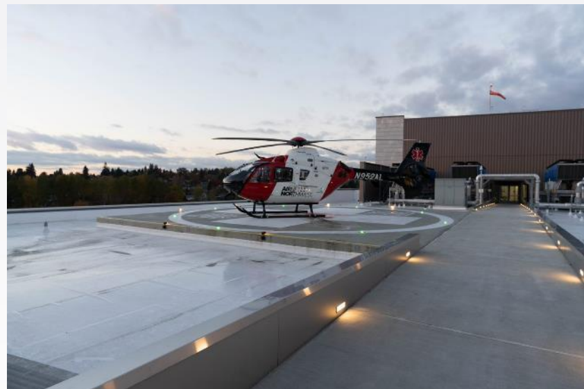
Helipad during a simulation event