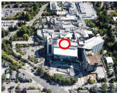
Aerial view with helipad circled in red