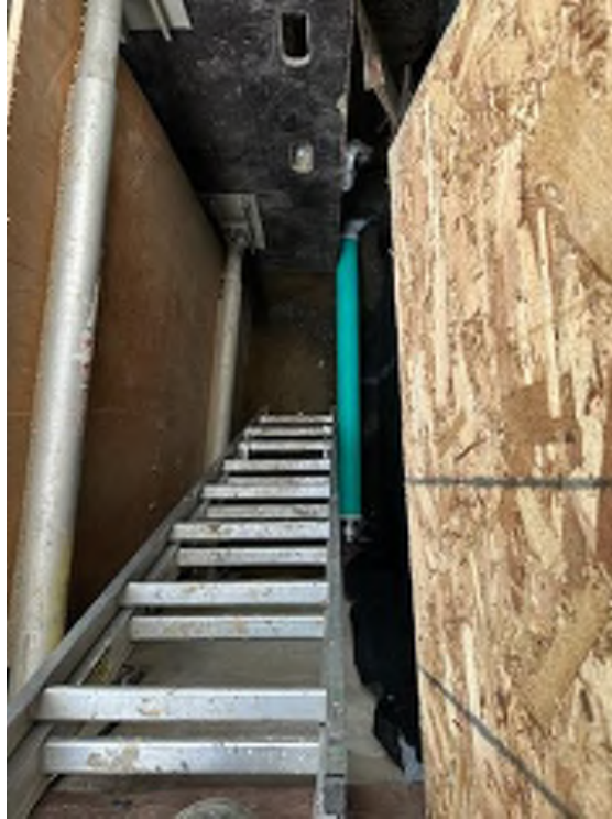
Waterproofing the foundation at the northwest corner of the residence where groundwater was collecting and moving into the basement. (Photo taken: September 27, 2023)