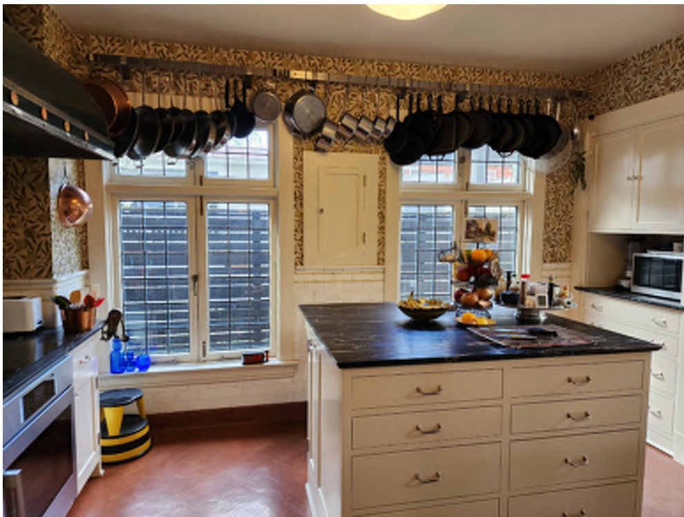
New custom built-in kitchen cabinets and countertops derived from the details in the Butler's Pantry, which retains its original cabinets. (Photo taken: April 17, 2024)