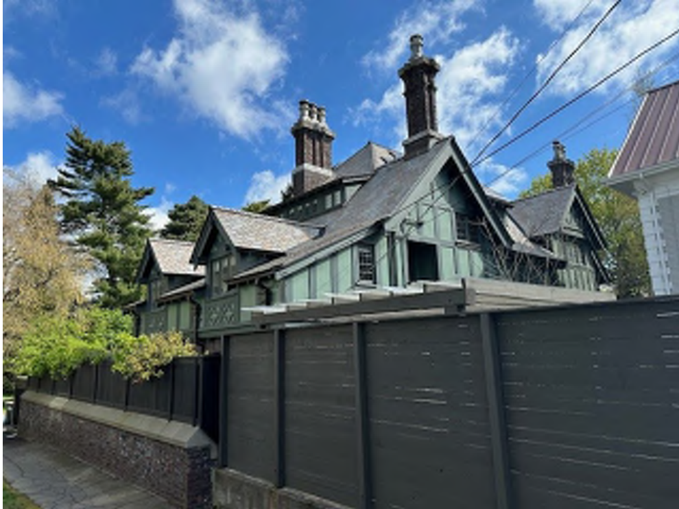
Existing residence viewed from southwest after construction. (Photo taken: April 17, 2024)