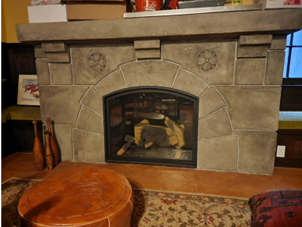
Reconstructed rathskeller fireplace surround with new fireplace insert. (Photo taken: April 17, 2024)