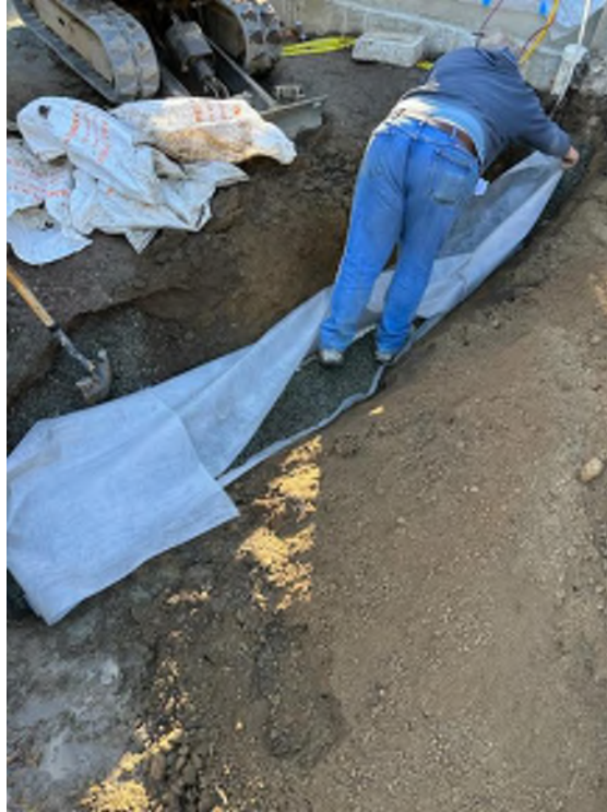
Drainage conduit to remove groundwater that collected around the northeast corner of the residence. (Photo taken: June 15, 2023)