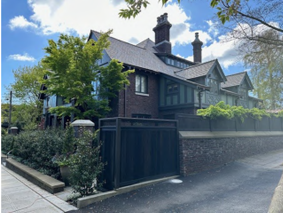
Existing residence viewed from northwest after construction. (Photo taken: April 17, 2024)