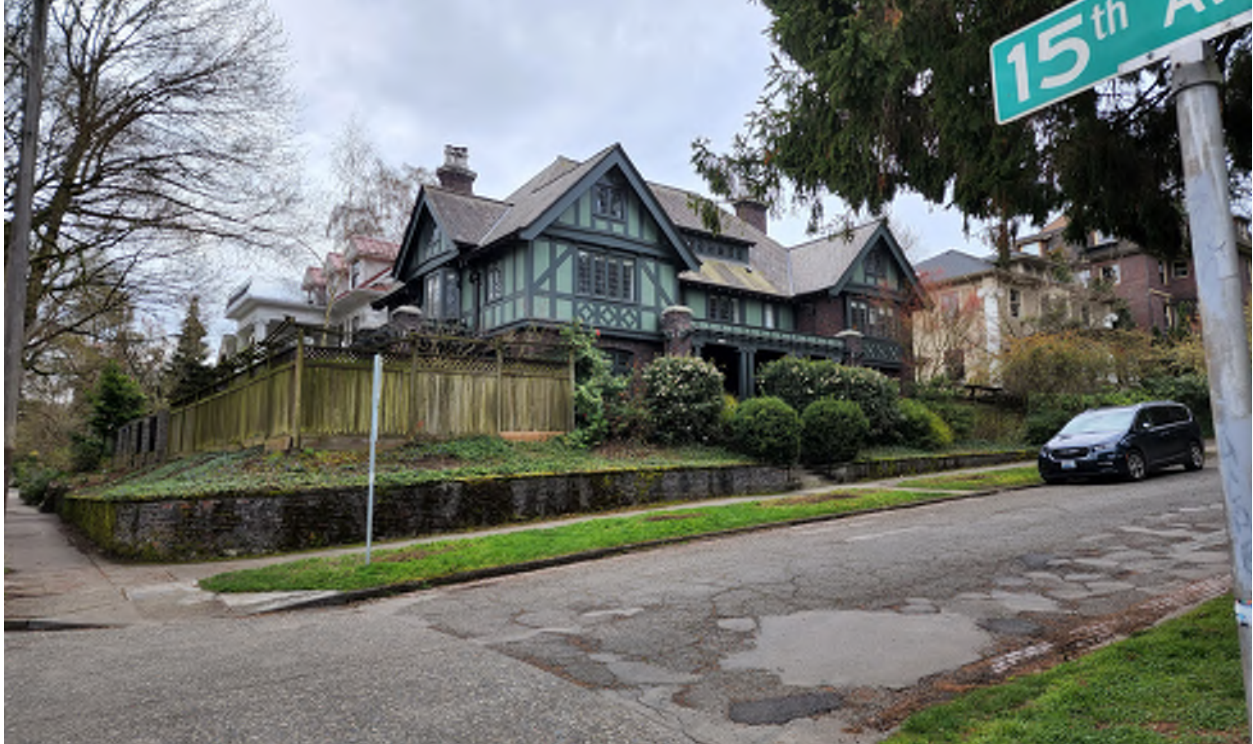
Existing residence viewed from northeast prior to construction. (Photo taken: March 25, 2022)