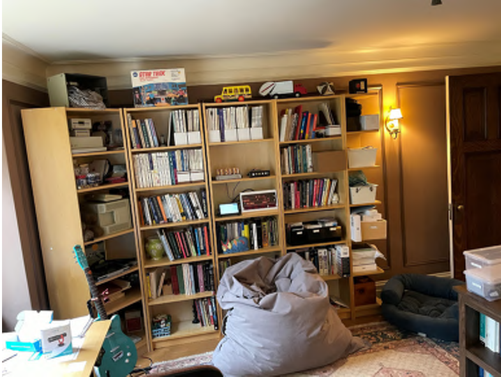
East wall of secondary bedroom before construction. (Photo taken: March 14, 2022)