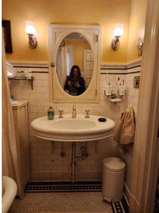
Original primary bathroom sink reinstalled after refinishing with new plumbing fixtures that closely match the original fixtures. (Photo taken: April 17, 2024)