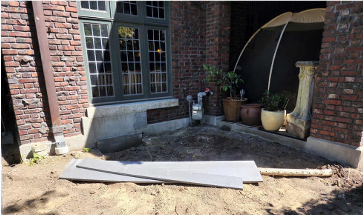
The coal chute was originally located below the dining room window at the northwest side of the house. It was removed by a previous owner and patched with an obtrusive concrete panel. (Photo taken: July 26,2022)