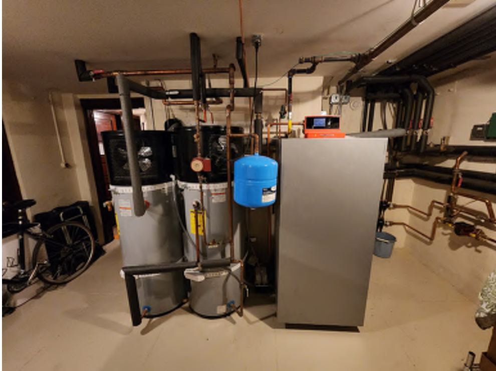
New boiler and water heaters. (Photo taken: April 17, 2024)