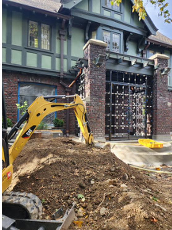
Installation of new steel frames into existing openings at east porch. (Photo taken: October 27, 2022)