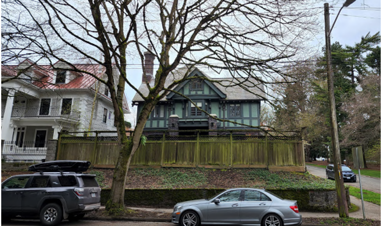
Existing residence viewed from east prior to construction. (Photo taken: March 25, 2022)