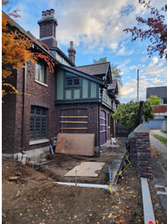
New stormwater collection pipes along the west side of the property. Note that the old coal chute patch has been removed and replaced with salvaged clinker brick to match the house. (Photo taken: November 11, 2022)