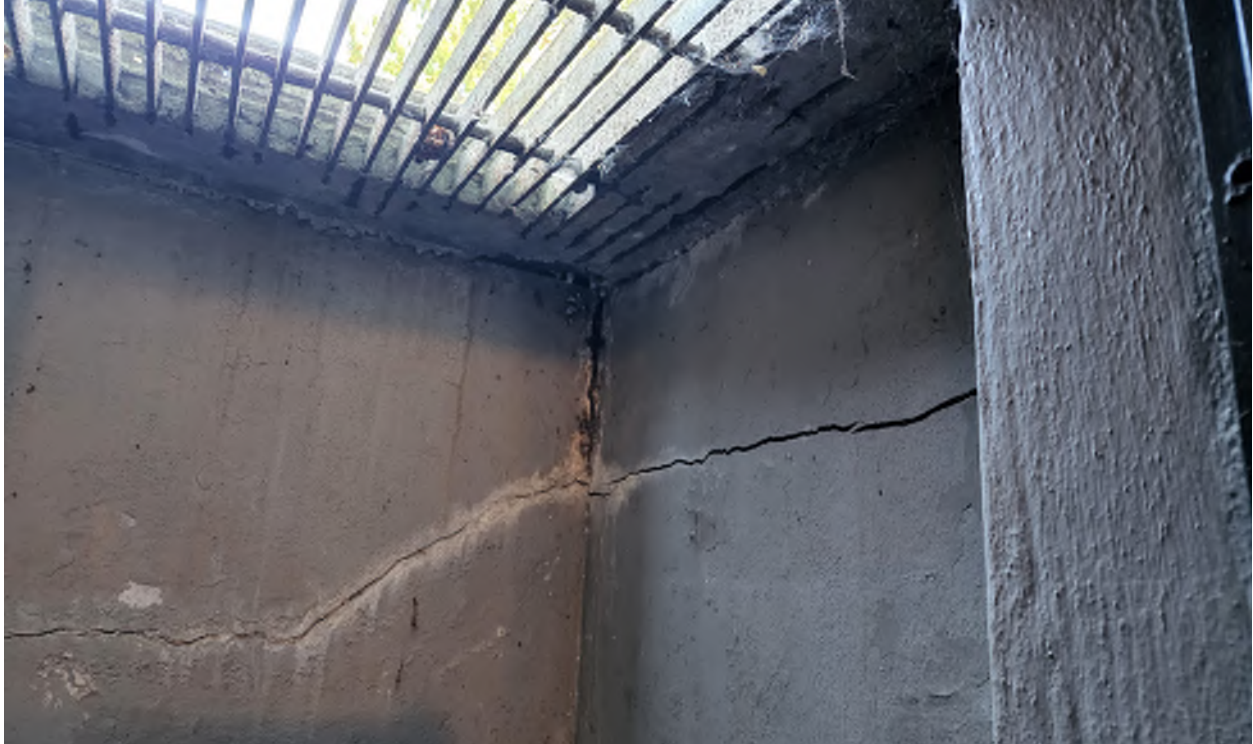
Cracking in the northeast window well. (Photo taken: August 2, 2022)