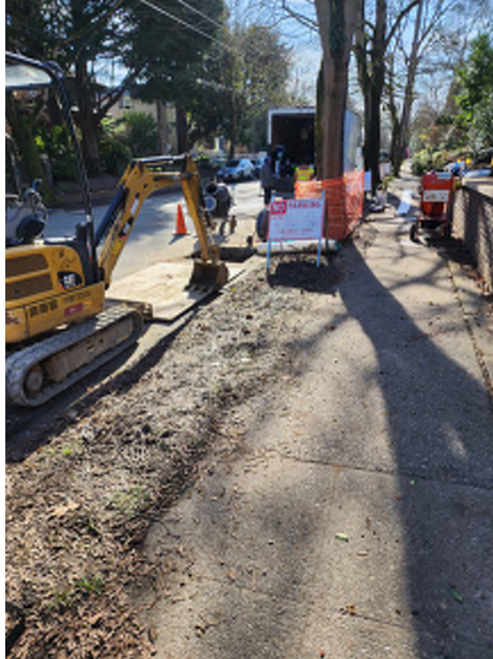
Storm and sanitary sewer repairs in 15th Avenue East. (Photo taken: February 15, 2023)