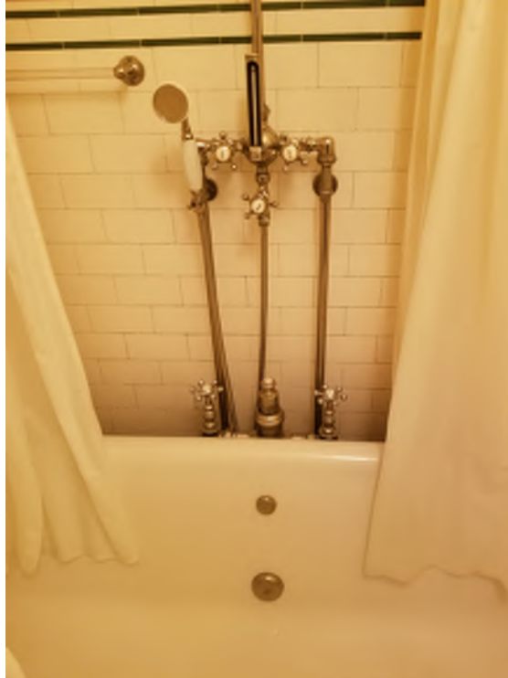
Original primary bathroom shower valves. (Photo taken: October 4, 2021)