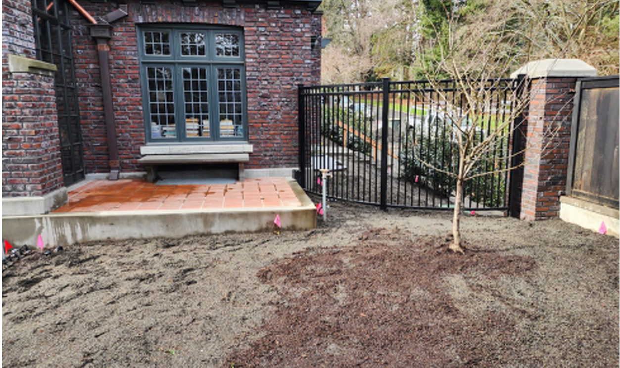
Reconstructed north bench at east patio. (Photo taken: February 22, 2023)