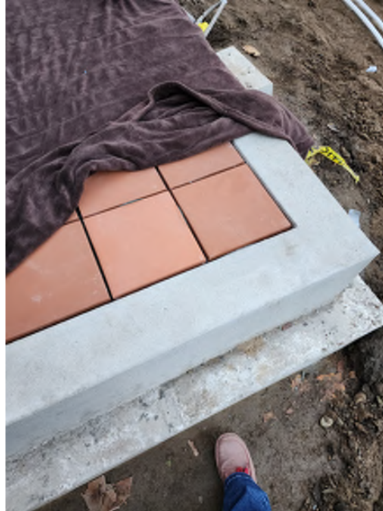
New terra cotta tile at reconstructed east patio. (Photo taken: November 15, 2022)