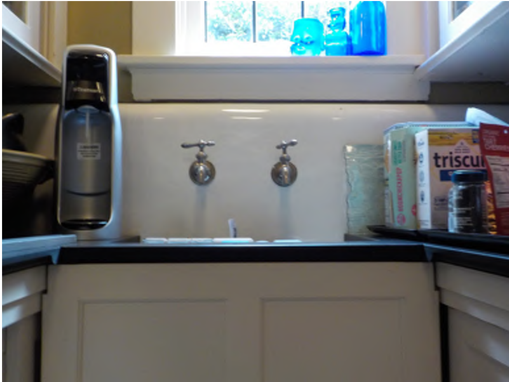
Original Butler's Pantry sink faucets which could no longer be repaired. (Photo taken: March 2, 2022)