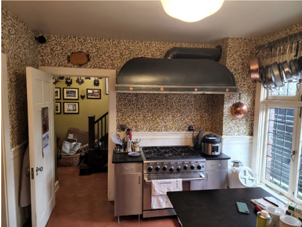
Non-original pre-manufactured kitchen cabinets that were installed by a previous owner. (Photo taken: March 21, 2022)