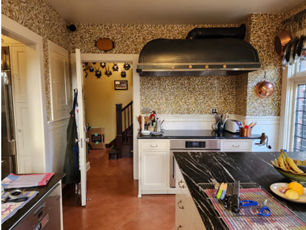
New custom built-in kitchen cabinets and countertops derived from the details in the Butler's Pantry, which retains its original cabinets. (Photo taken: April 17, 2024)