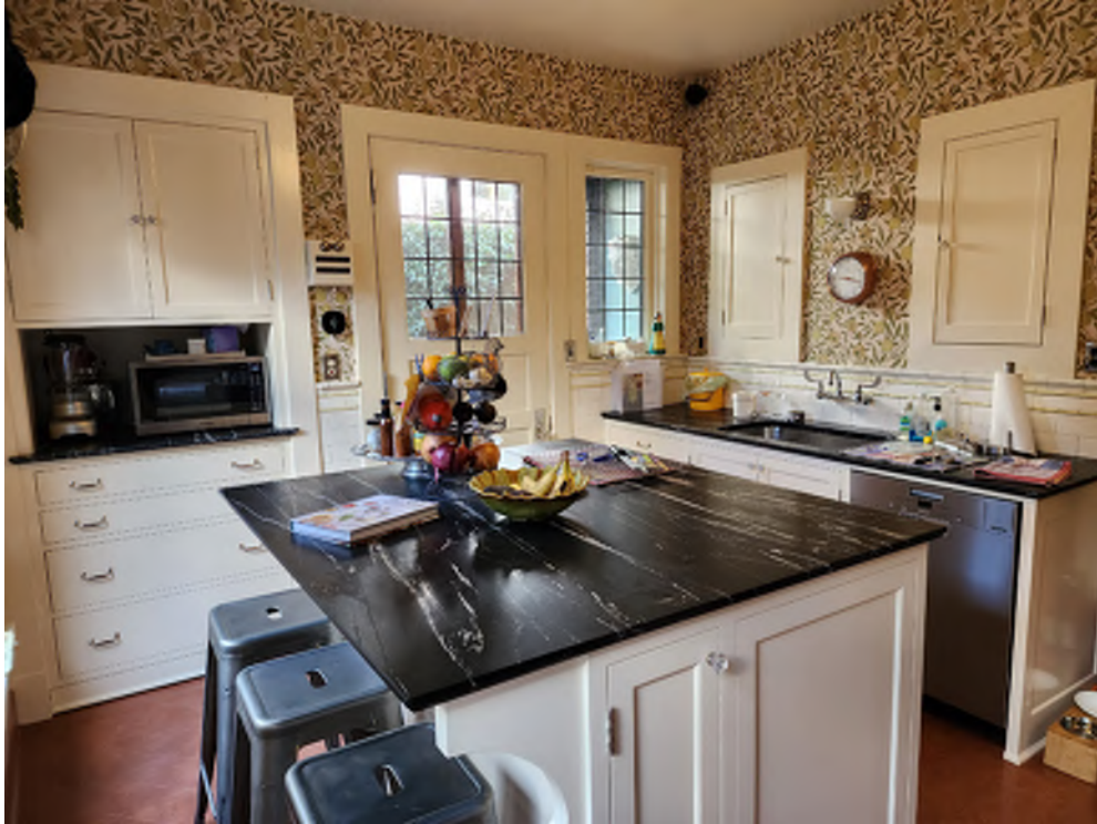
New custom built-in kitchen cabinets and countertops derived from the details in the Butler's Pantry, which retains its original cabinets. A tile backsplash closely matching the original was installed behind the sink (Photo taken: April 17, 2024)