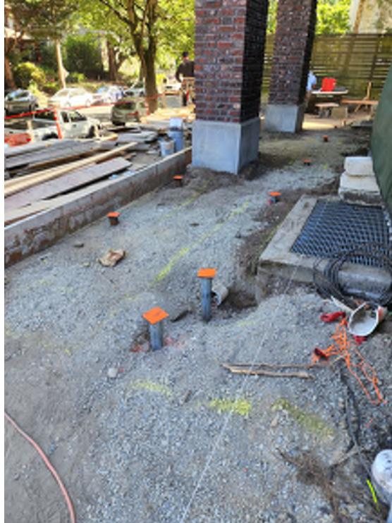
Pipe piles below the reconstructed east patio. (Photo taken: July 26, 2022)