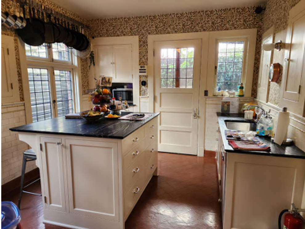
New custom built-in kitchen cabinets and countertops derived from the details in the Butler's Pantry, which retains its original cabinets. (Photo taken: April 17, 2024)