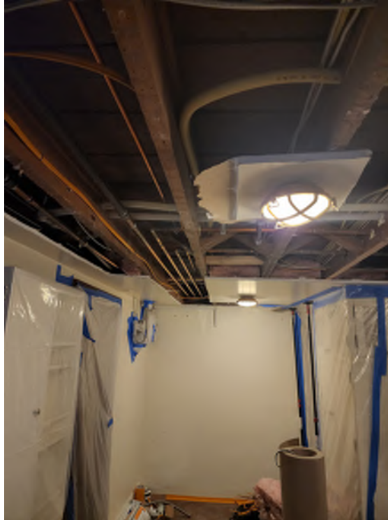
Installation of kitchen radiant floor heating from below. (Photo taken: August 30, 2022)