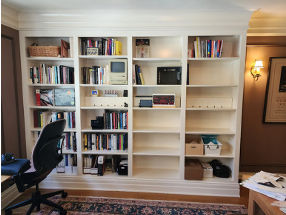
New built-in bookshelves on east wall of secondary bedroom. (Photo taken: April 14, 2023)