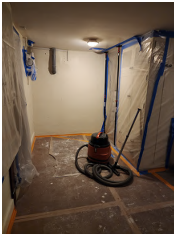
Ceiling repair after the radiant floor heating was installed in the kitchen. (Photo taken: January 3, 2023)