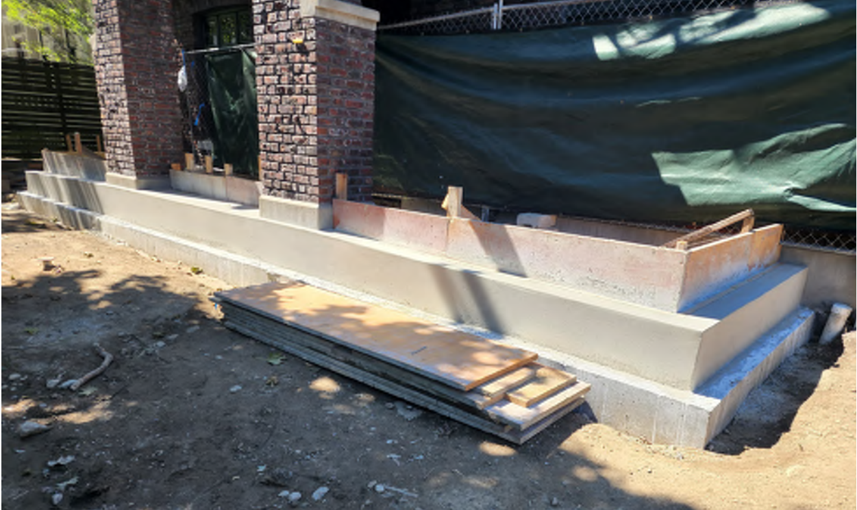
New concrete at reconstructed east patio. (Photo taken: August 23, 2022)