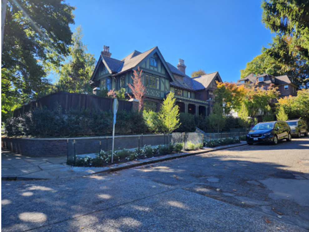
Existing residence viewed from northeast at the end of construction. (Photo taken: October 6, 2023.)