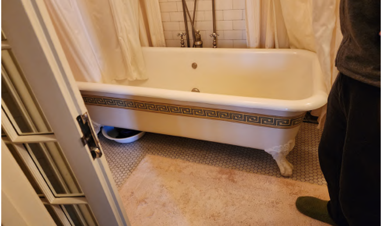
The original primary bathtub before refinishing. The Greek key decoration was added by the current owners and is not historic. (Photo taken: December 21, 2022)