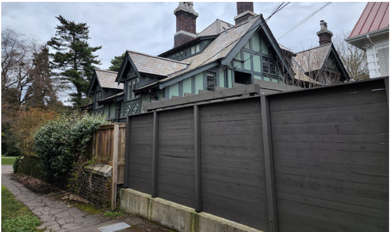
Existing residence viewed from southwest prior to construction. (Photo taken: March 25, 2022)