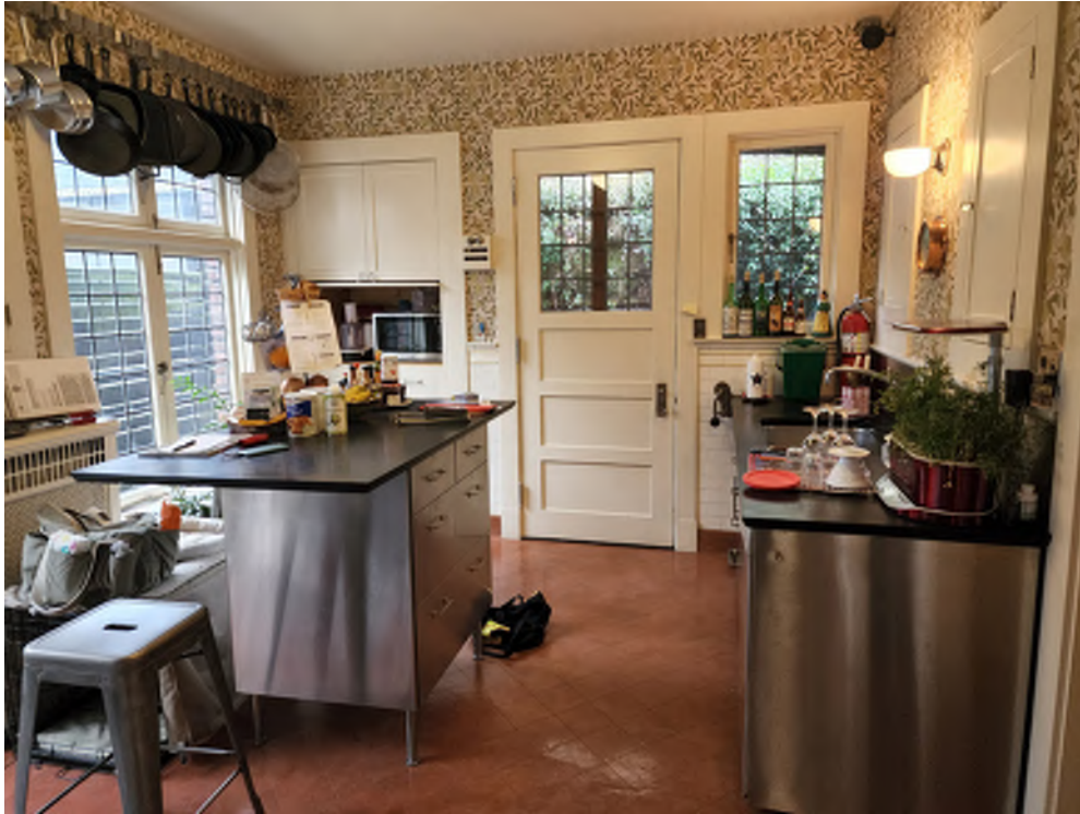
Non-original pre-manufactured kitchen cabinets that were installed by a previous owner. A non-original cabinet that was installed in place of the original icebox is also visible in the southwest corner of next to the kitchen door. (Photo taken: March 21, 2022)