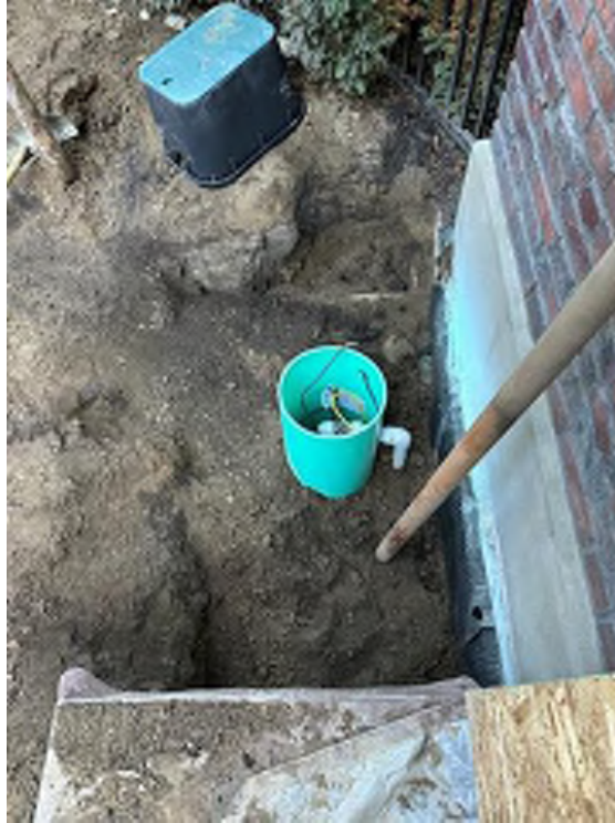
Exterior sump pump and catchment to remove groundwater that collects around the northeast corner of the residence. (Photo taken: September 27, 2023)