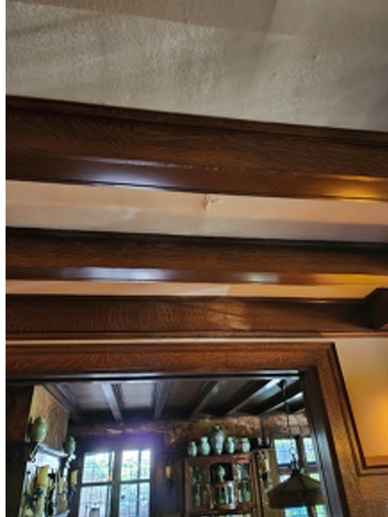
Water damage at foyer ceiling from the bathroom above. (Photo taken: September 8, 2023)