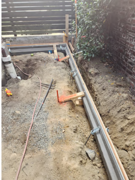
New stormwater collection pipes at the southwest corner of the property. (Photo taken: October 19, 2022)