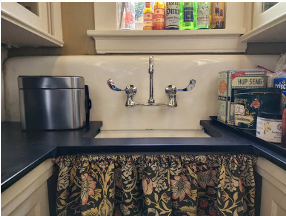
New Butler's Pantry faucet. A non-original cabinet panel was also removed below the sink and replaced with a curtain. (Photo taken: April 17, 2024)