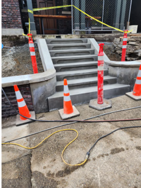
Reconstructed front entry steps. (Photo taken: October 19, 2022)