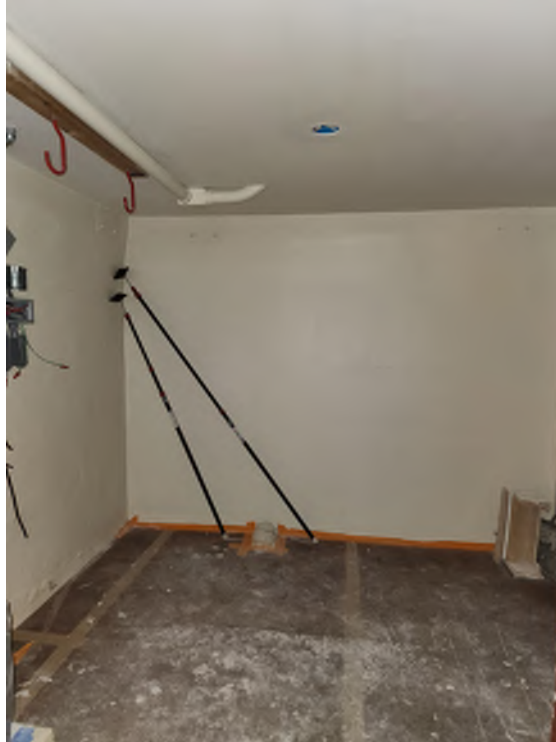
Ceiling repair after the radiant floor heating was installed in the kitchen. (Photo taken: January 3, 2023)