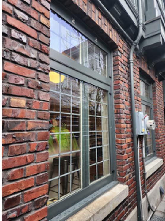
New removable storm windows installed over original kitchen windows. (Photo taken: January 30, 2024)