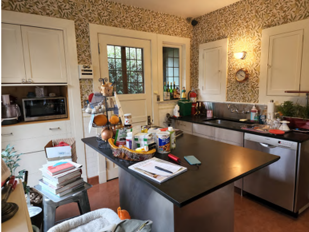
Non-original pre-manufactured kitchen cabinets that were installed by a previous owner. Note the metal backsplash behind the sink. (Photo taken: March 21, 2022)