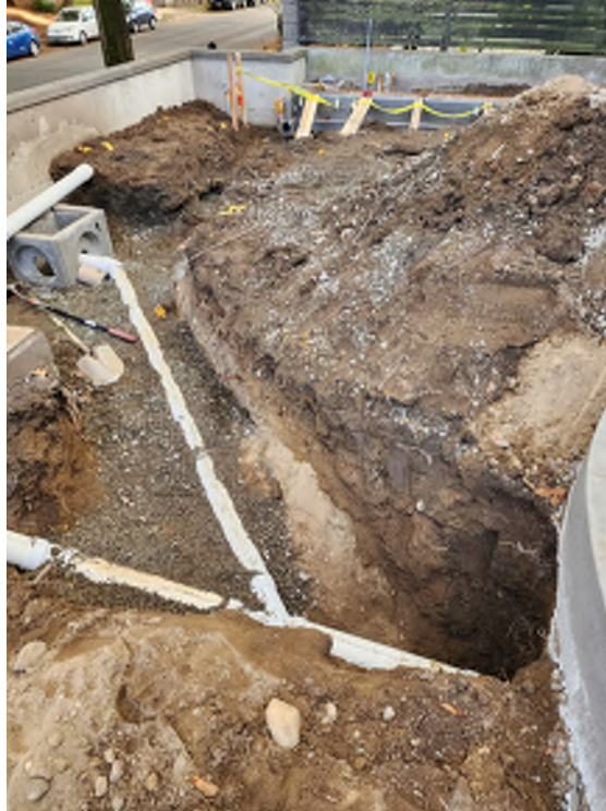
Storm and sanitary sewer repairs in east yard. (Photo taken: November 1, 2022)