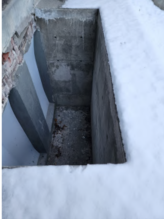
View inside the northwest window well showing the new concrete for stabilization. (Photo taken: December 21, 2022)