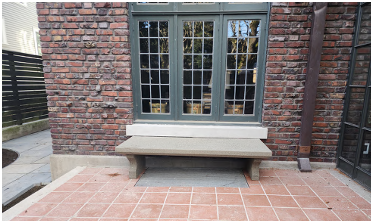
Reconstructed south bench at east patio. (Photo taken: February 10, 2023)