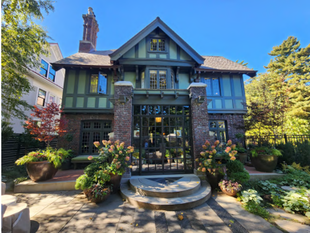
Reconstructed east patio after construction. (Photo taken: October 6, 2023)