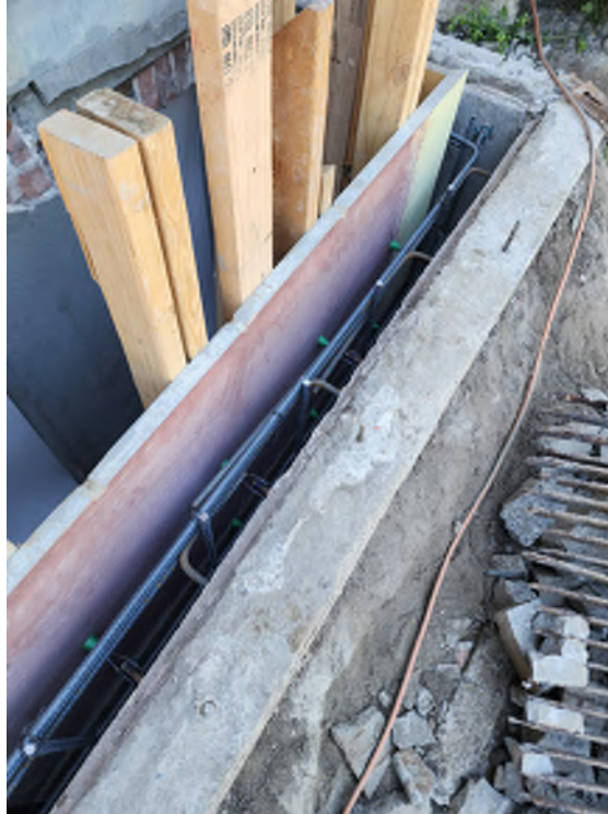
Formwork for new concrete work to stabilize the northeast window well from the inside. Note the deteriorated window well grate at the right of the photo. (Photo taken: September 20, 2022)