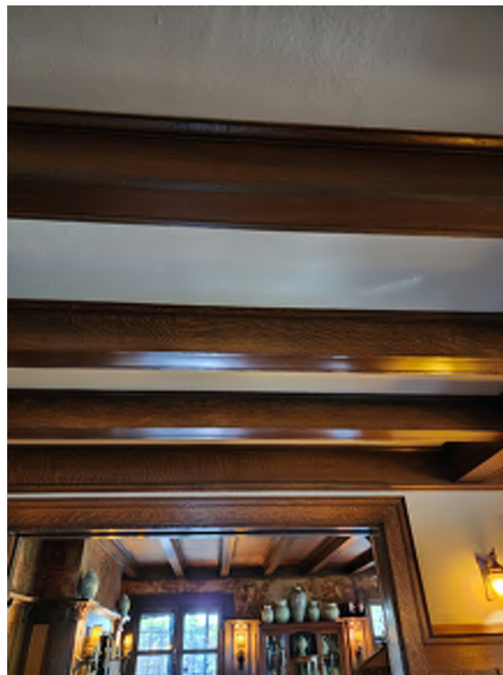
Repaired plaster at foyer ceiling. (Photo taken: April 17, 2024)