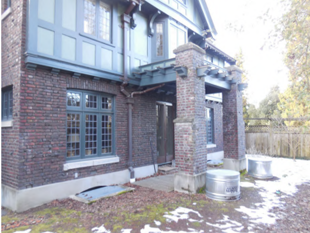
Existing east elevation prior to construction. The original east patio was badly damaged and had been carefully documented and removed in 2007. (Photo taken: August 20, 2021)