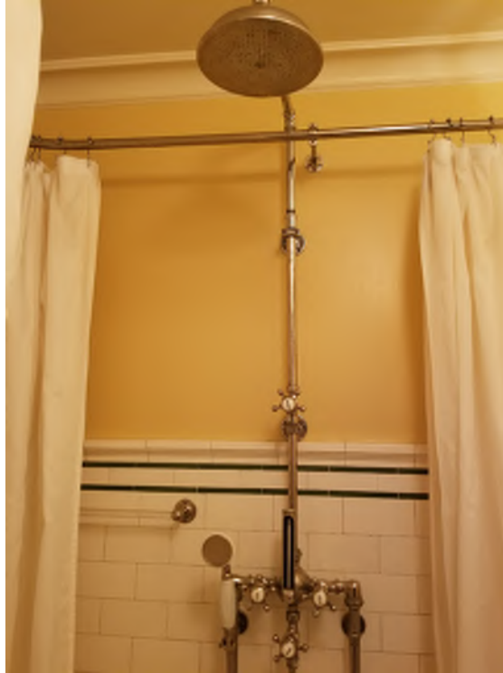
Original primary bathroom showerhead. (Photo taken: October 4, 2021)