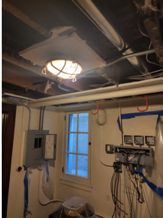
Installation of kitchen radiant floor heating from below and electrical subpanel upgrades. (Photo taken: August 30, 2022)