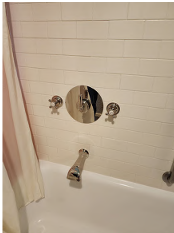
New shower valves and tub filler in the guest bathroom. (Photo taken: April 17, 2024)