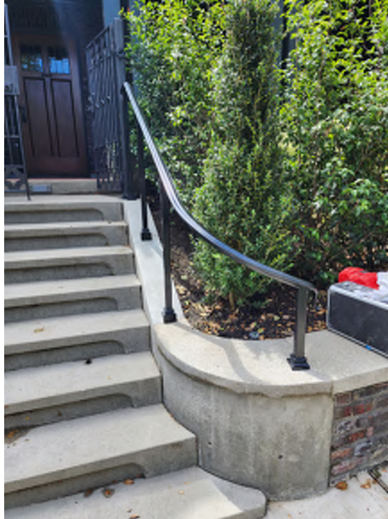
New handrail for accessibility at front entry stairs. (Photo taken: July 25, 2023)