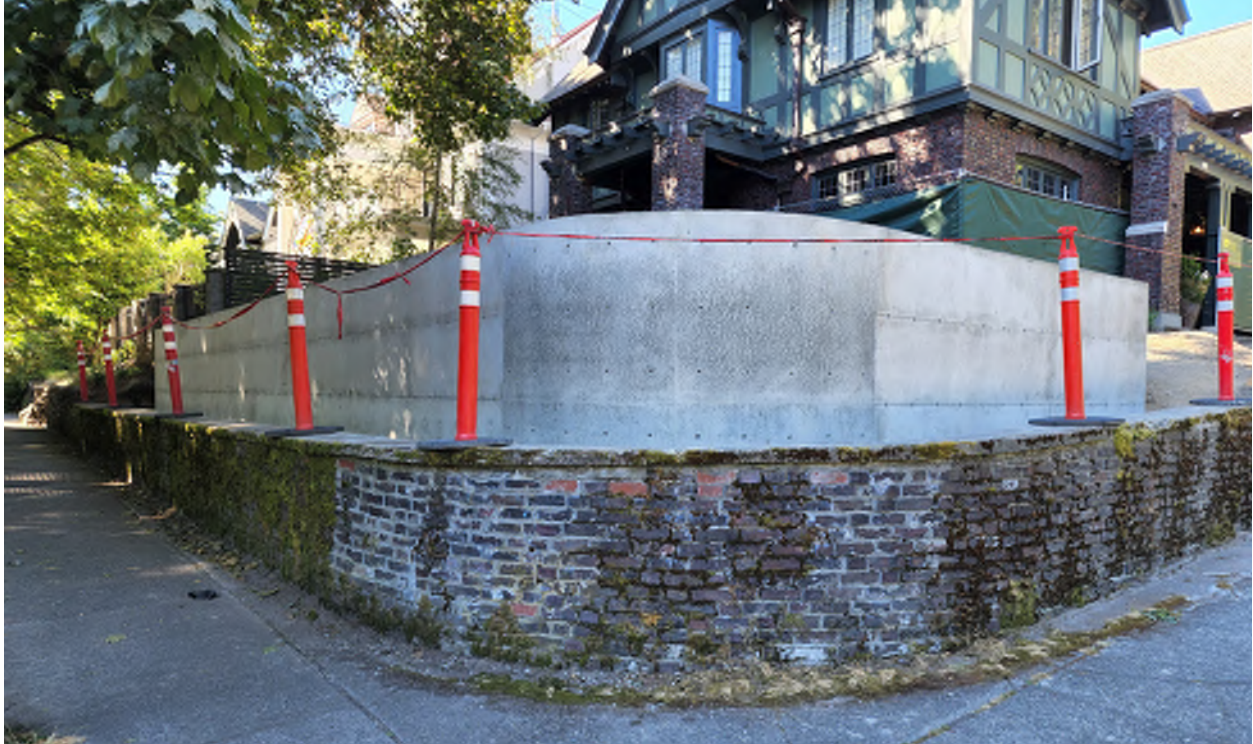
Historic site wall at the northeast corner of the property before repointing. (Photo taken: August 29, 2022)