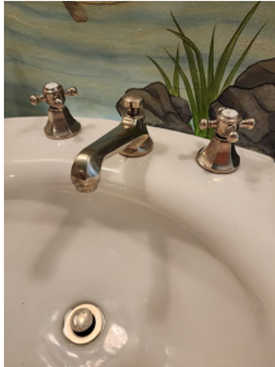
Existing sink faucet in the guest bathroom that had been replaced by a previous owner. (Photo taken: July 25, 2023)