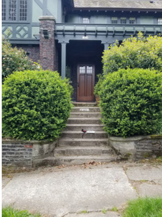
Original entry steps prior to construction. (Photo taken: May 6, 2021)