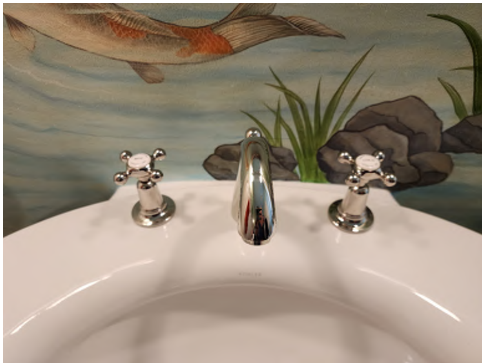
New sink faucet in the guest bathroom. (Photo taken: April 17, 2024)