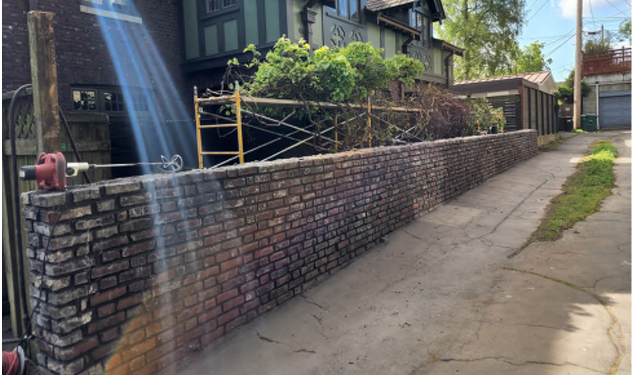
Repointing historic brick site wall at west edge of property. An established jasmine plant to be retained can be seen supported by scaffolding inside the fence. (Photo taken: May 11, 2022)