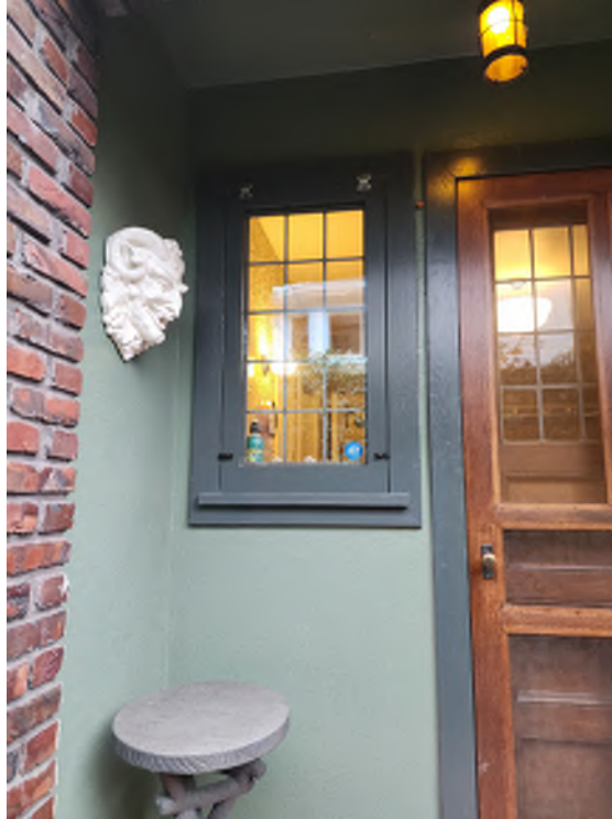
New removable storm window installed over original kitchen window. (Photo taken: January 30, 2024)