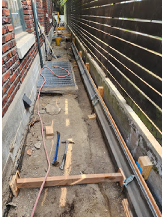
New stormwater collection pipes along the south edge of the property. (Photo taken: October 19, 2022)