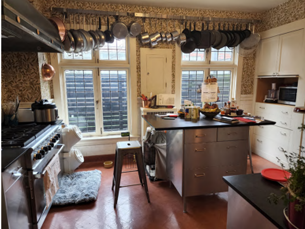
Non-original pre-manufactured kitchen cabinets that were installed by a previous owner. (Photo taken: March 21, 2022)