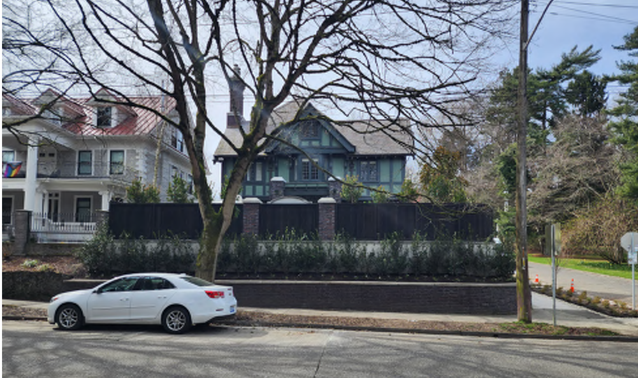
Existing residence viewed from east near the end of construction. (Photo taken: March 28, 2023)