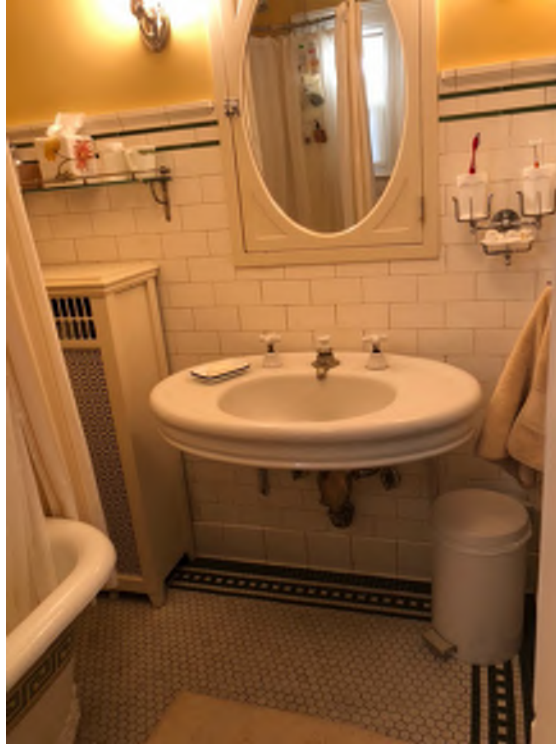
Original primary bathroom sink and faucet. (Photo taken: September 23, 2021)