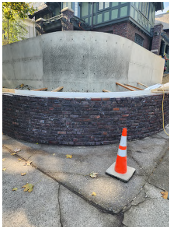
Repointed historic site wall at the northeast corner of the property. (Photo taken: October 26, 2022)