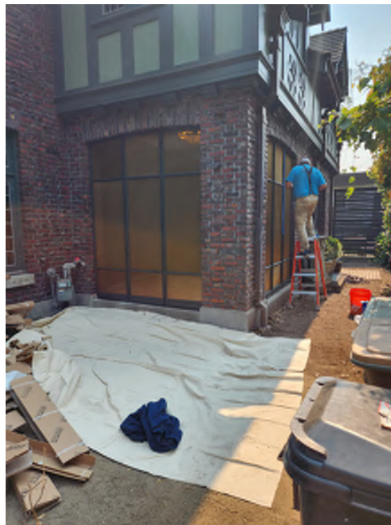
New screened enclosure inserted into existing openings at west porch. (Photo taken: September 9, 2022)