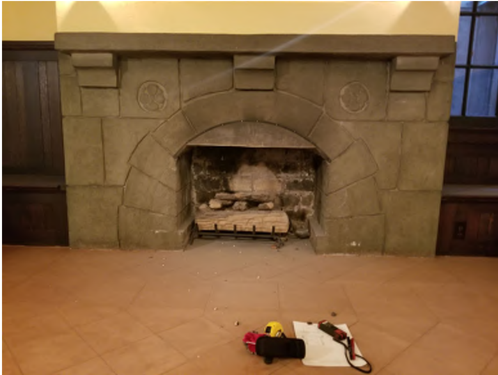
Original rathskeller fireplace surround. (Photo taken: June 25, 2021)