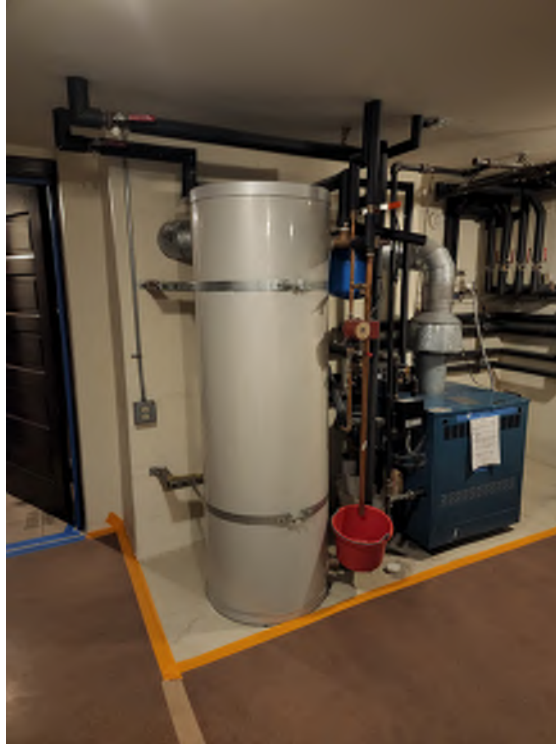
Existing boiler and water heater. (Photo taken: August 9, 2022)