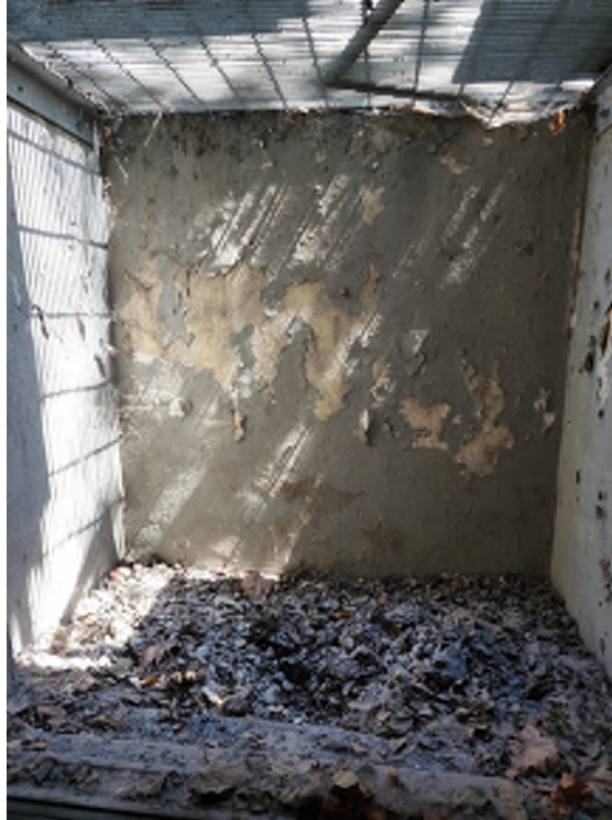
Peeling paint applied to the inside of the window wells by a previous owner was removed. (Photo taken: August 2, 2022)