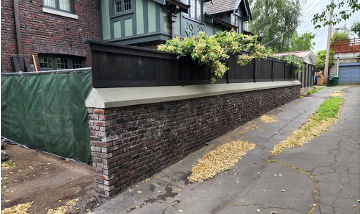
New concrete cap at the west site wall with replacement privacy fencing installed on top. (Photo taken: July 18, 2022)