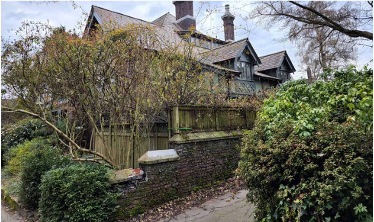
Existing residence viewed from northwest prior to construction. (Photo taken: March 25, 2022)