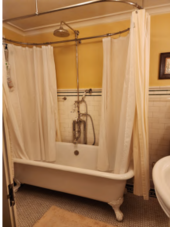
New primary bathroom plumbing fixtures that closely match the original fixtures. (Photo taken: April 17, 2024)