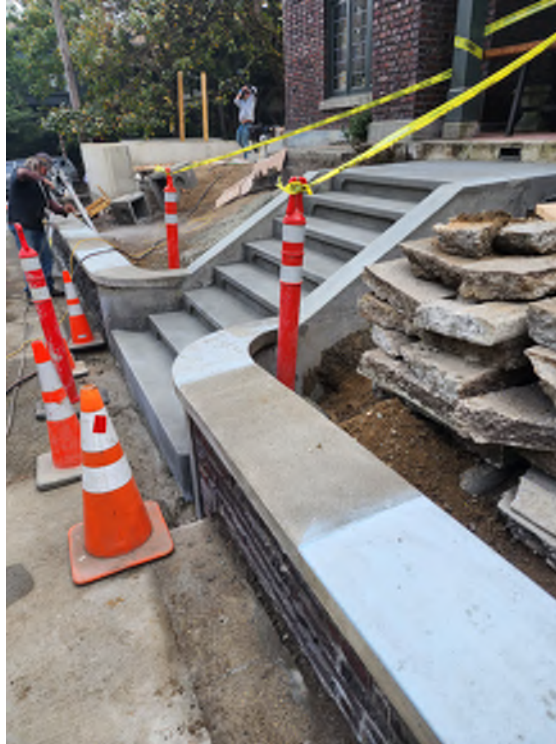
Reconstructed front entry steps with reconstructed low site wall cap. The lighter sections of the cap were in the process of being acid-etched to darken the tone of the fresh concrete. (Photo taken: October 19, 2022)