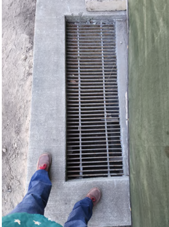
Original window well grate with spalling metal visible. These were originally cast into the concrete window wells, and a later concrete cap was added on top of the northeast well that was causing it to crack and pull away from the house. (Photo taken: July 26, 2022)