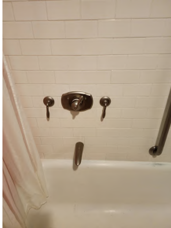
Existing shower valves and tub filler in the guest bathroom that had been replaced by a previous owner. (Photo taken: July 25, 2023)