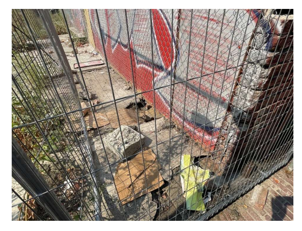
Close up of the southern "tunnel" (note the cardboard used to ease trespassing).

The Owner is prepared to promptly demolish the existing structure on the Property to address public safety concerns as soon as authorized by a City permit. As you are aware, due to the Property's landmark status, the Owner is unable to do so without SDCI approval of the Permit. We respectfully ask that SDCI approve demolition per SMC 23.40.008.B in the face of the pressing threat to public health and safety. There are no commercially viable alternatives to demolition because the current financial markets and construction costs do not support redevelopment of the Property, even if the City issued all permits for the new apartment development. Additionally, the City is still reviewing the Master Use Permit and Certificate of Approval for the Project, and the Project's building permit applications have not yet been submitted; so even if financial conditions did somehow greatly improve, it would be at least 15-18 months before construction could begin.