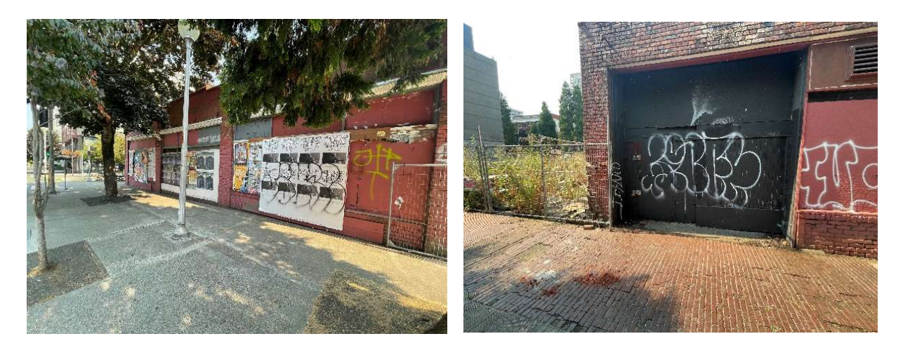
Left: 2<sup>nd</sup> Avenue façade (western) Right: Alley façade (eastern) both as of August 8, 2024

Despite all reasonable efforts, trespassers continue to illegally enter the Property. Given the adjacent site was demolished, trespassers were breaking in through a former party wall. In July 2024, per a City request, the Owner installed fencing, plywood, and hardening measures to deter the break-ins.