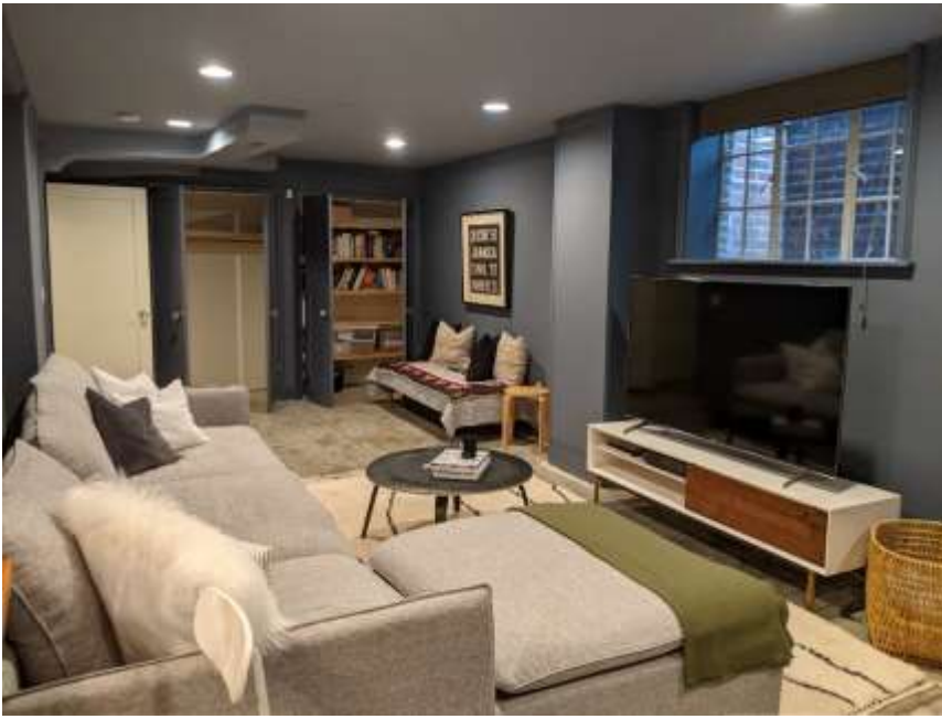
Basement (finished product: new window, new flooring, paint, new electrical, etc):