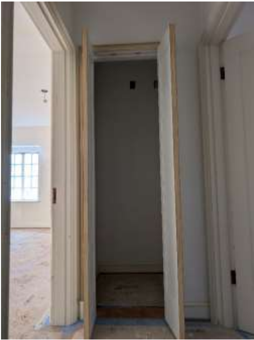
Master bedroom closet (before construction):