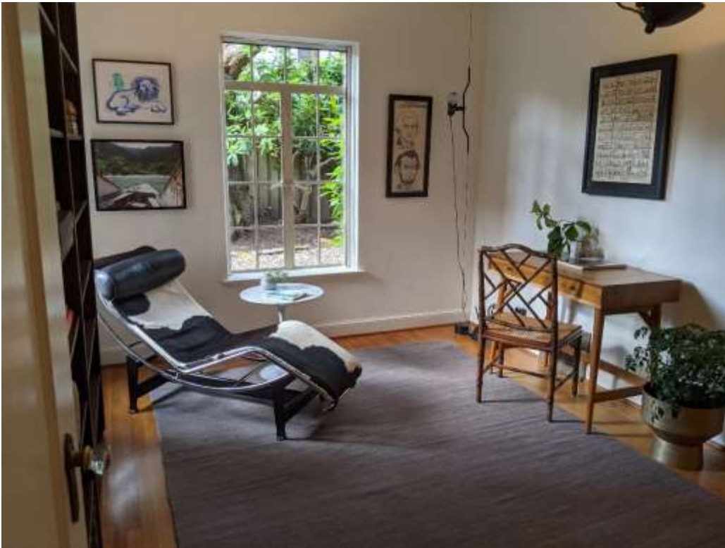
1 st Floor TV Room (after construction – expanded & now includes an additional window):