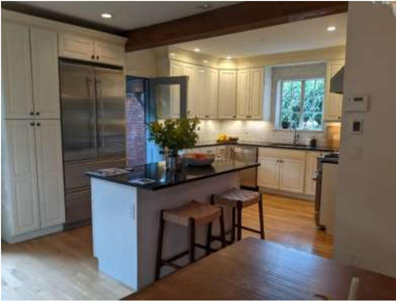
1 st Floor Kitchen (finished product):