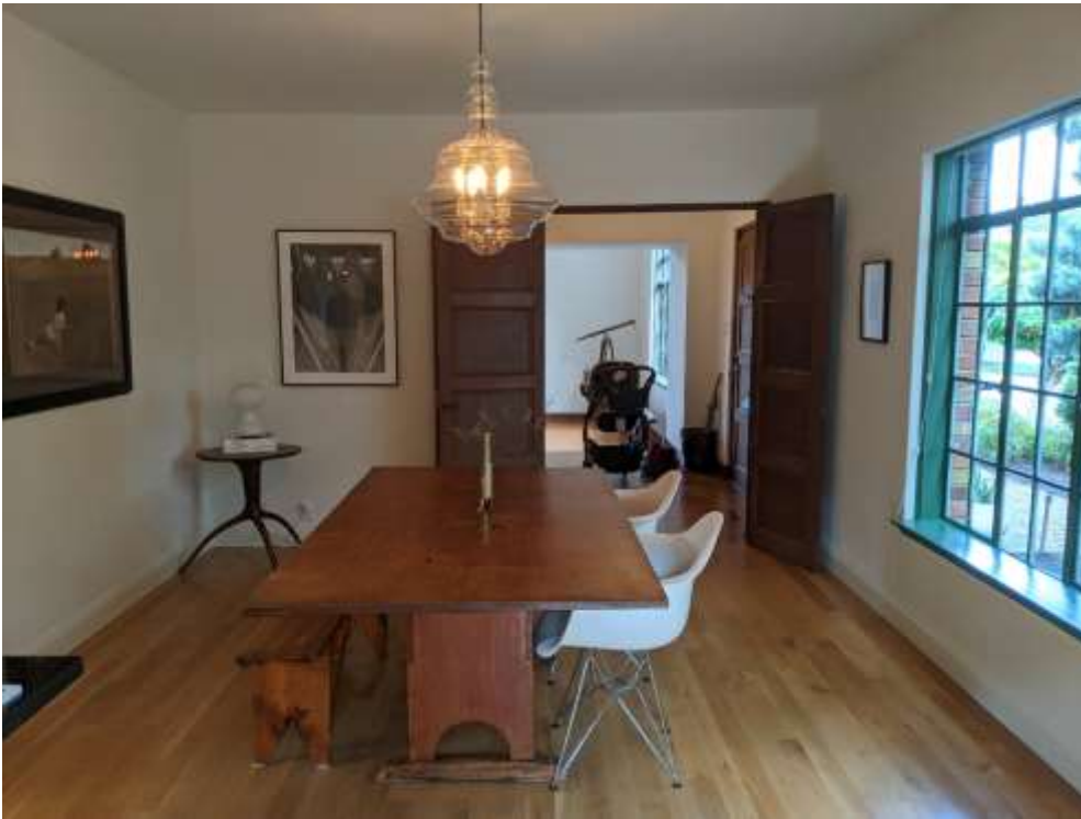
1 st Floor Dining Area (after construction):