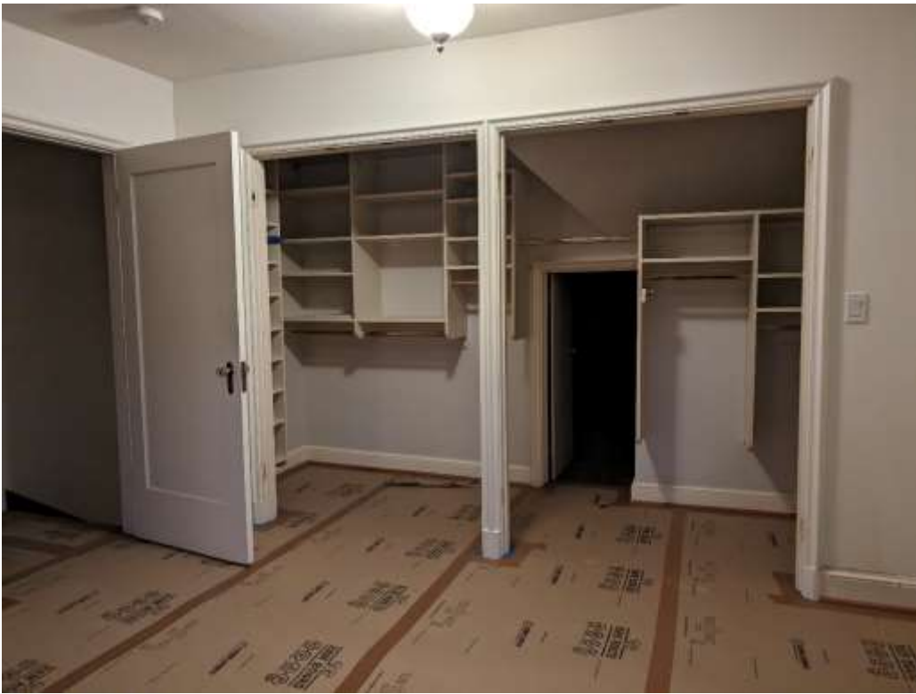
Master bedroom closet (finished product):