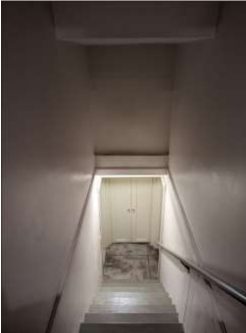
Basement Stairwell (After – during construction):