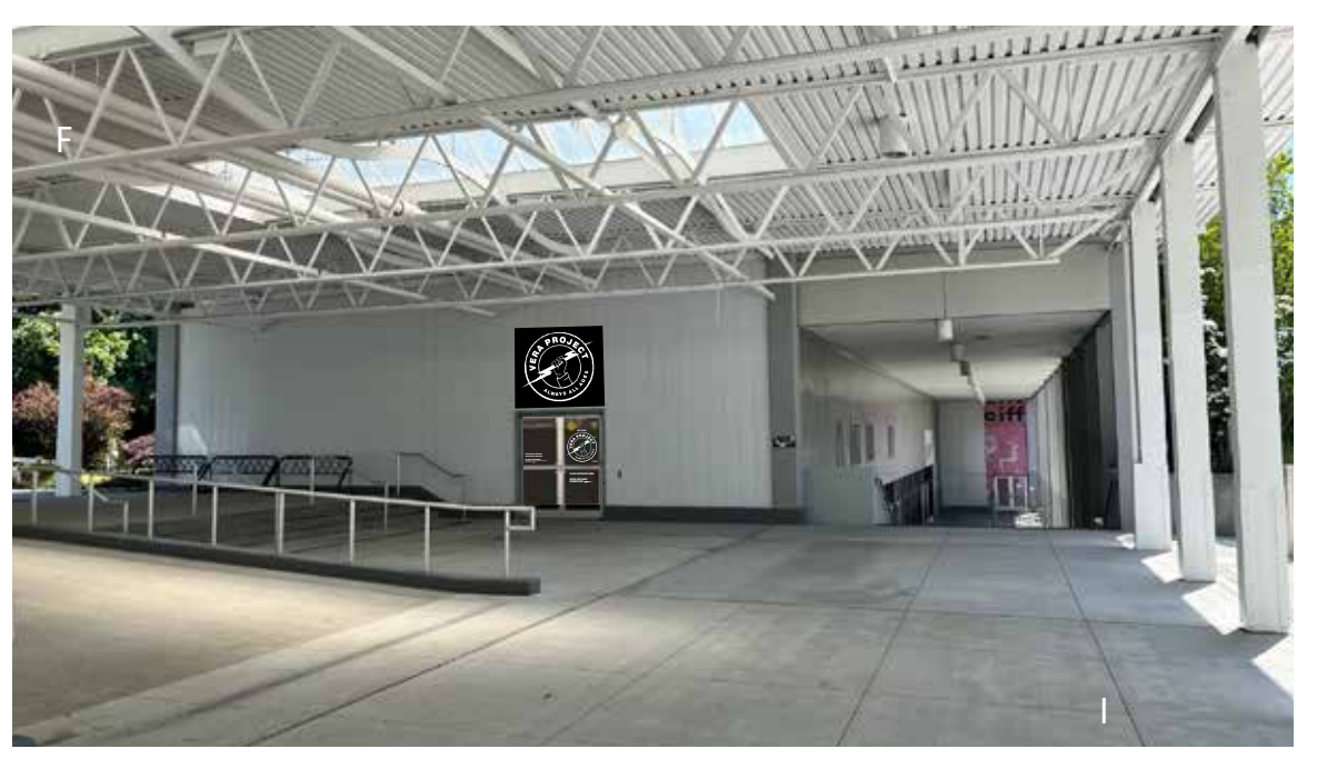
C | 3M WRAP (CONTONUOUS ADHESIVE SHEET)