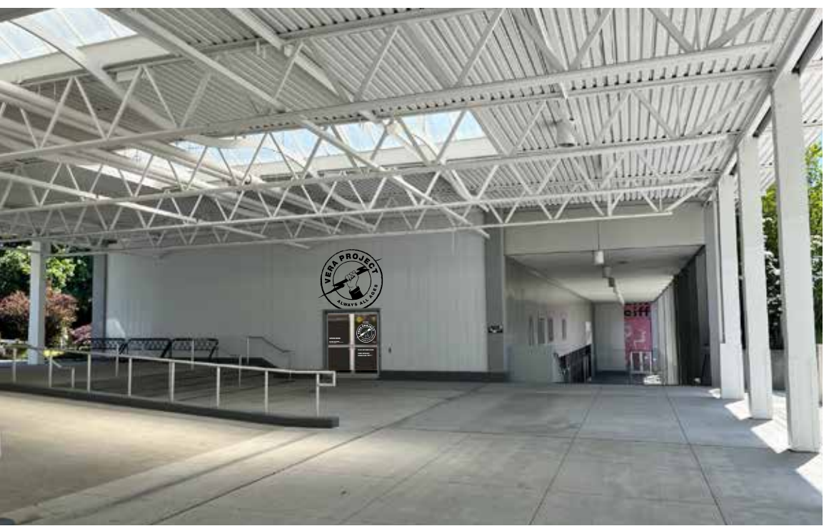
G | ADHESIVE CUT VINYL