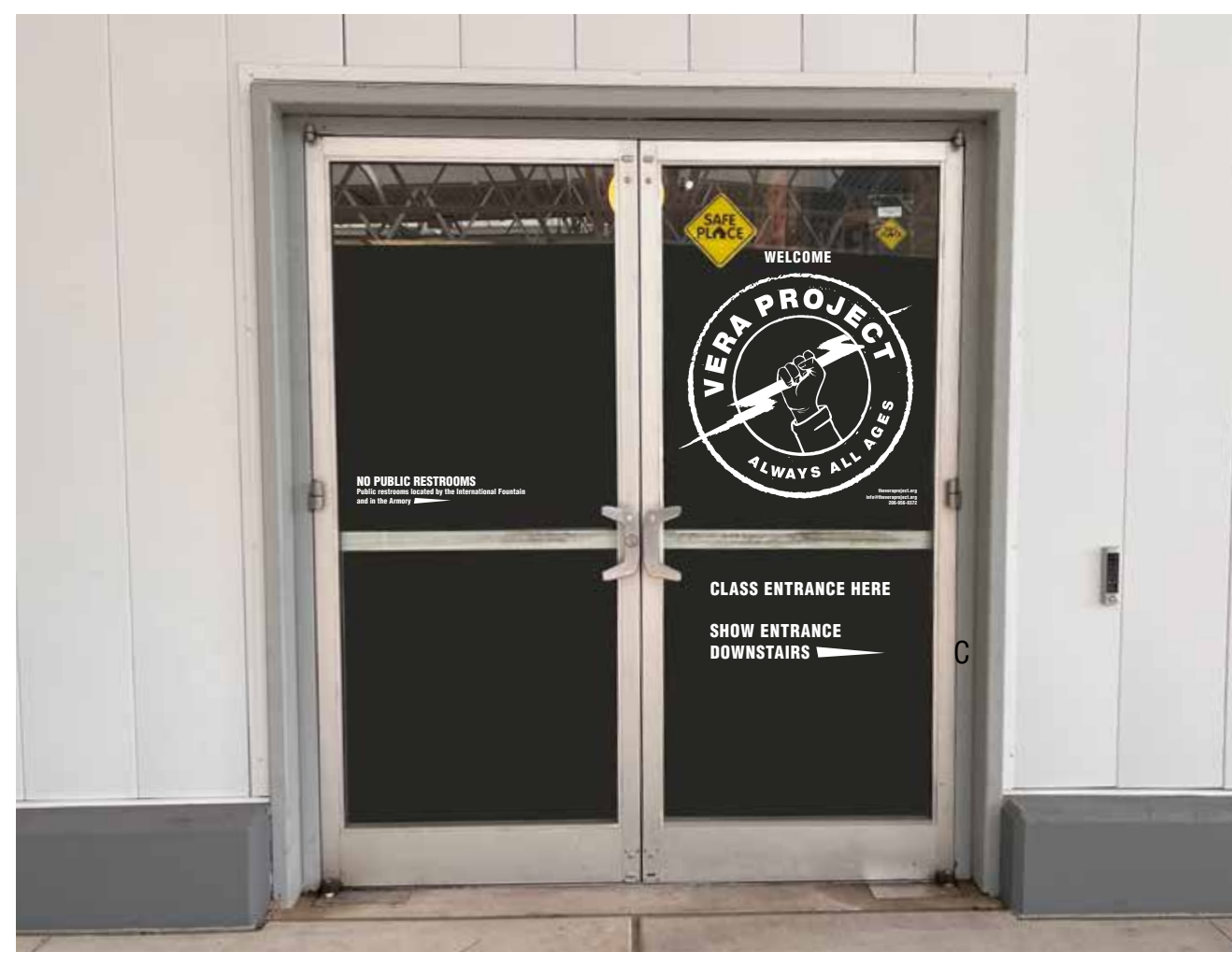
I | EXISTING