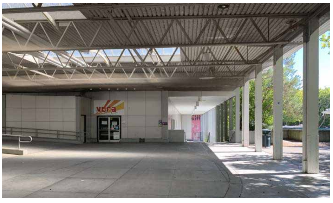
A | PREVIOUSLY EXISTING SIGN