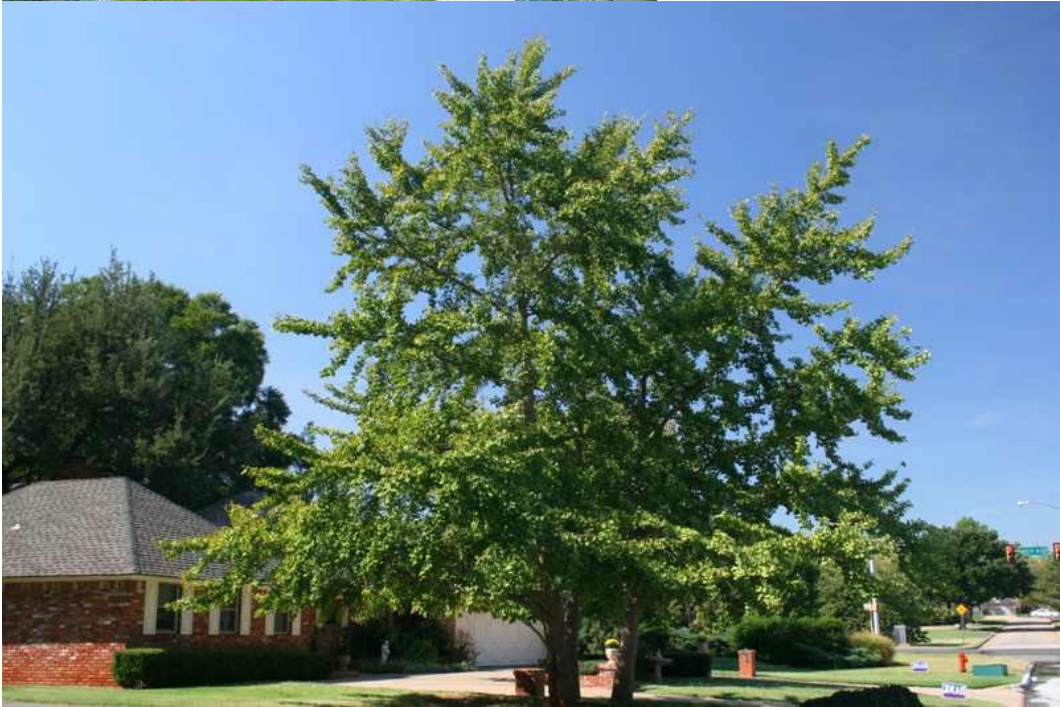
Examples of proposed tree in summer color w/ building in background for scale. Two Examples.