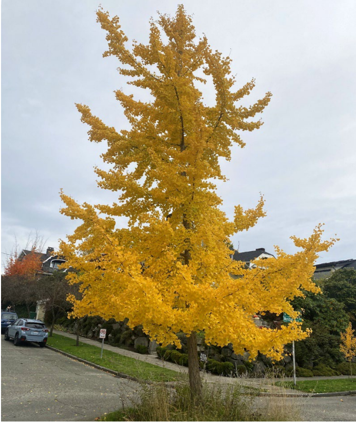
Example of tree in Fall color.