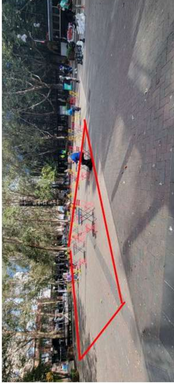
Photo of Proposed Area Location