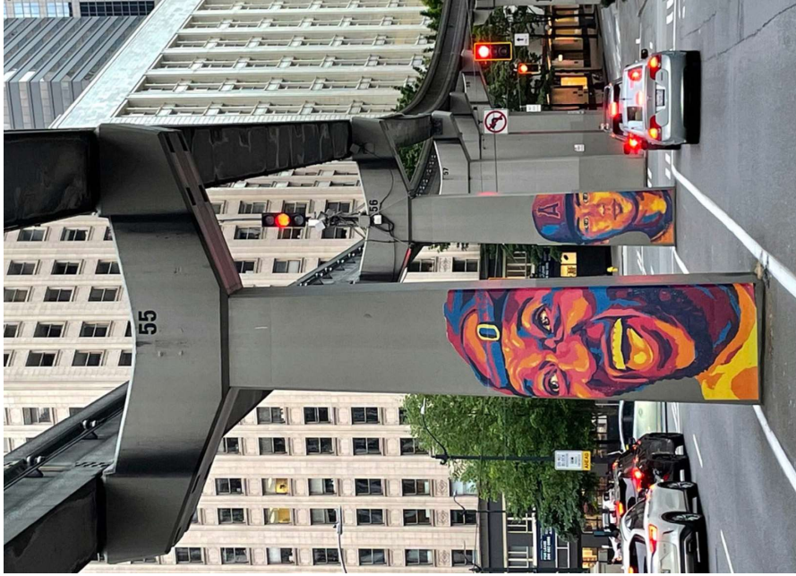
Visit Seattle Monorail Portraits