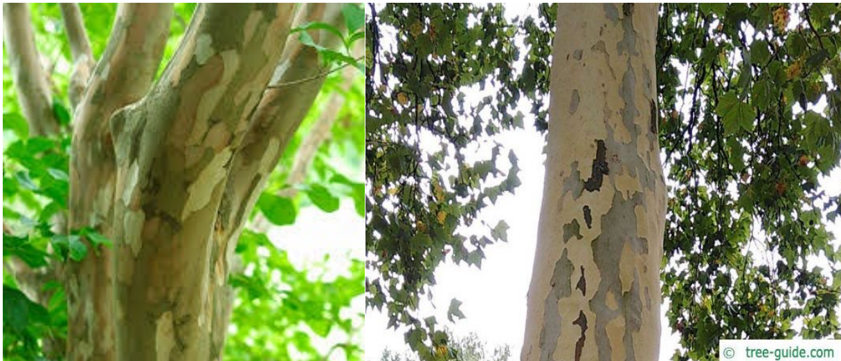
Japanese Stewartia bark (above left) similar aesthetic to London Plane bark (above right)

The aesthetic of Japanese Stewartia's bark matches the London Plane. Both have smooth and peeling white-ish bark. Both London Plane and Japanese Stewartia are very tough trees and can thrive in a highly urbanized setting like this.