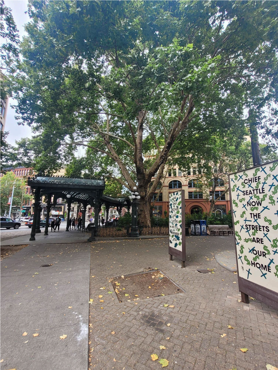
Location 1 (above)