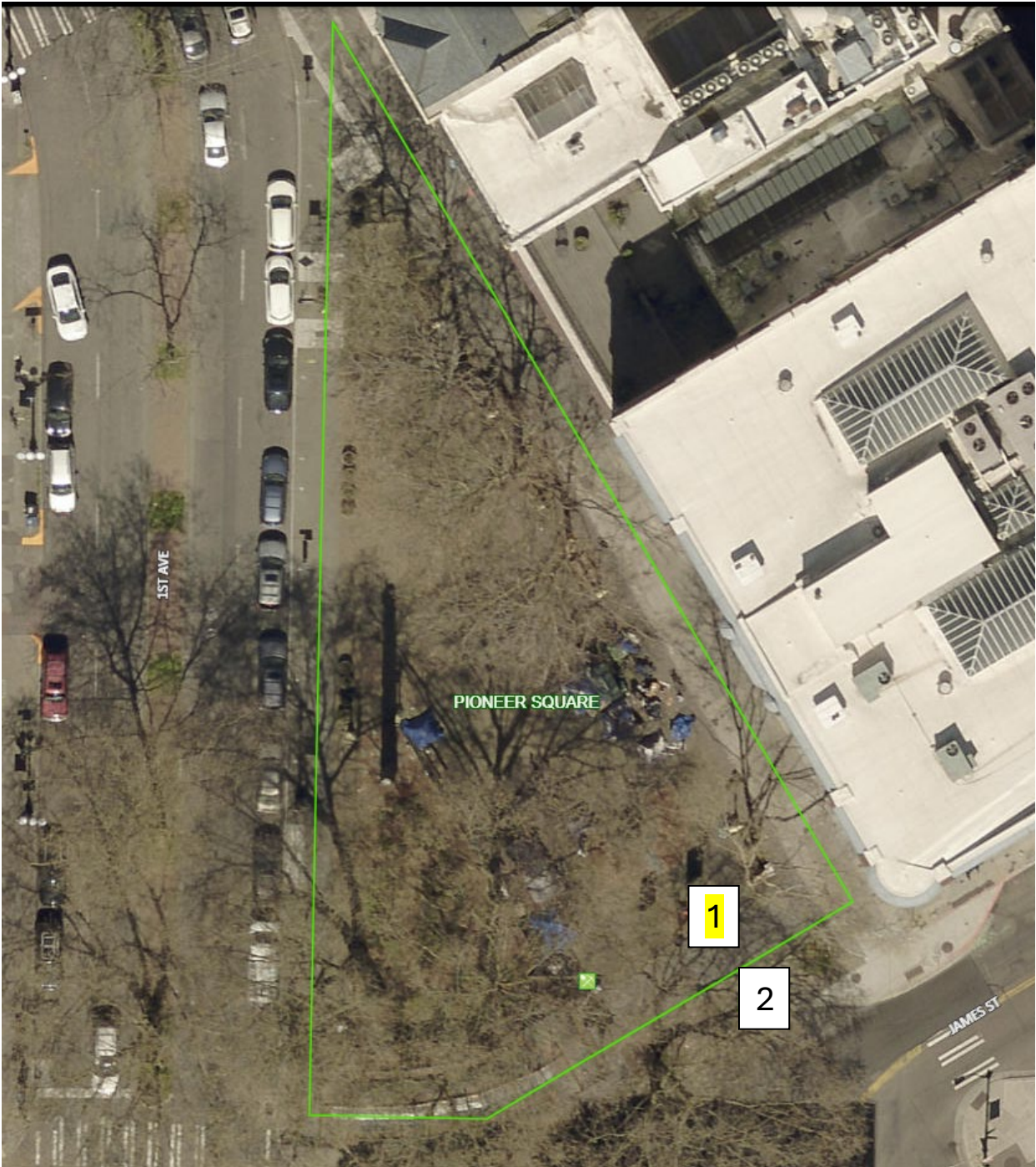
Locations of 2 future Japanese Stewartias (above)