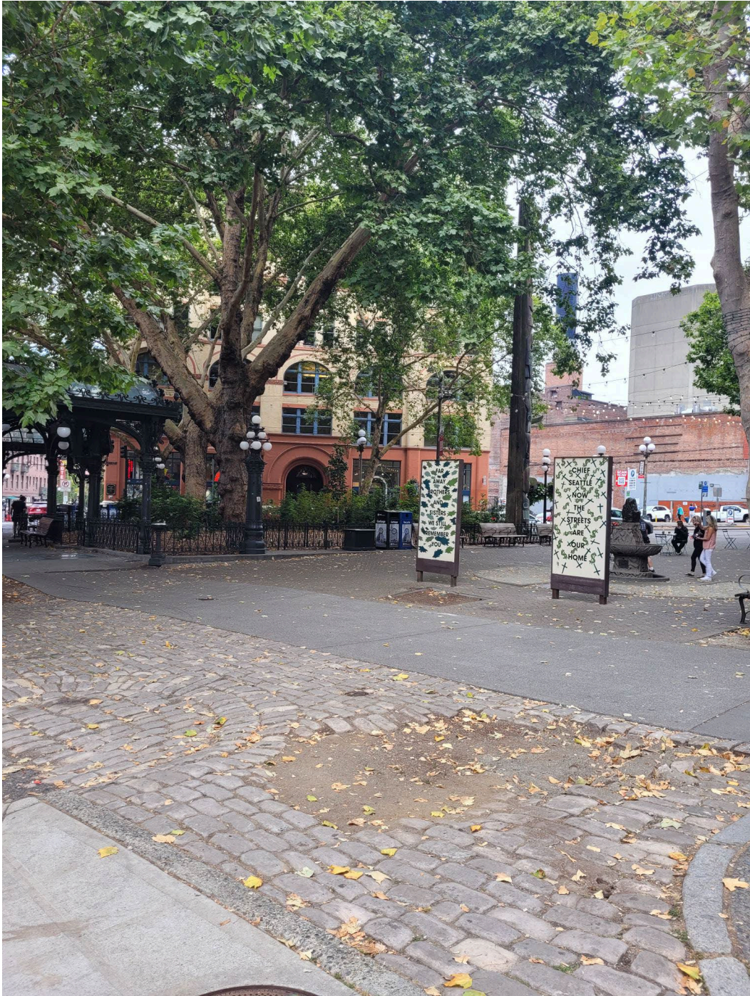
Location 2 (above)