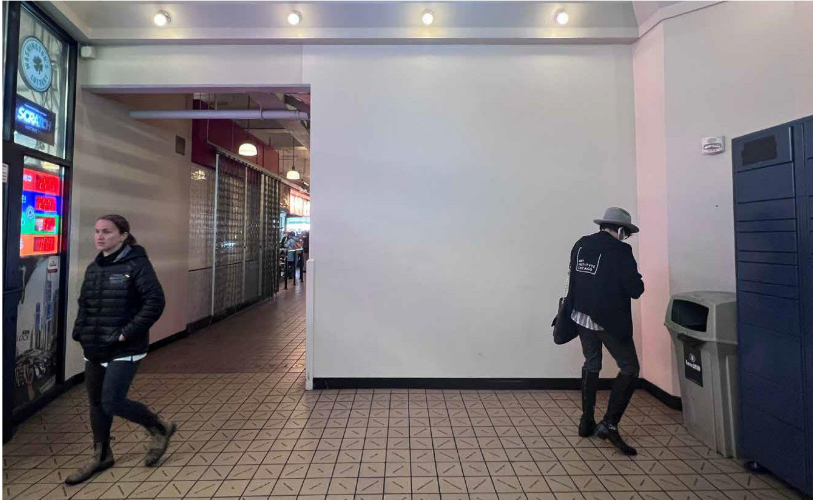
Pike Place Market Interpretation, March 3, 2023