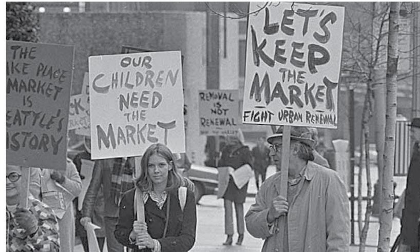
Pike Place Market Interpretation, March 3, 2023