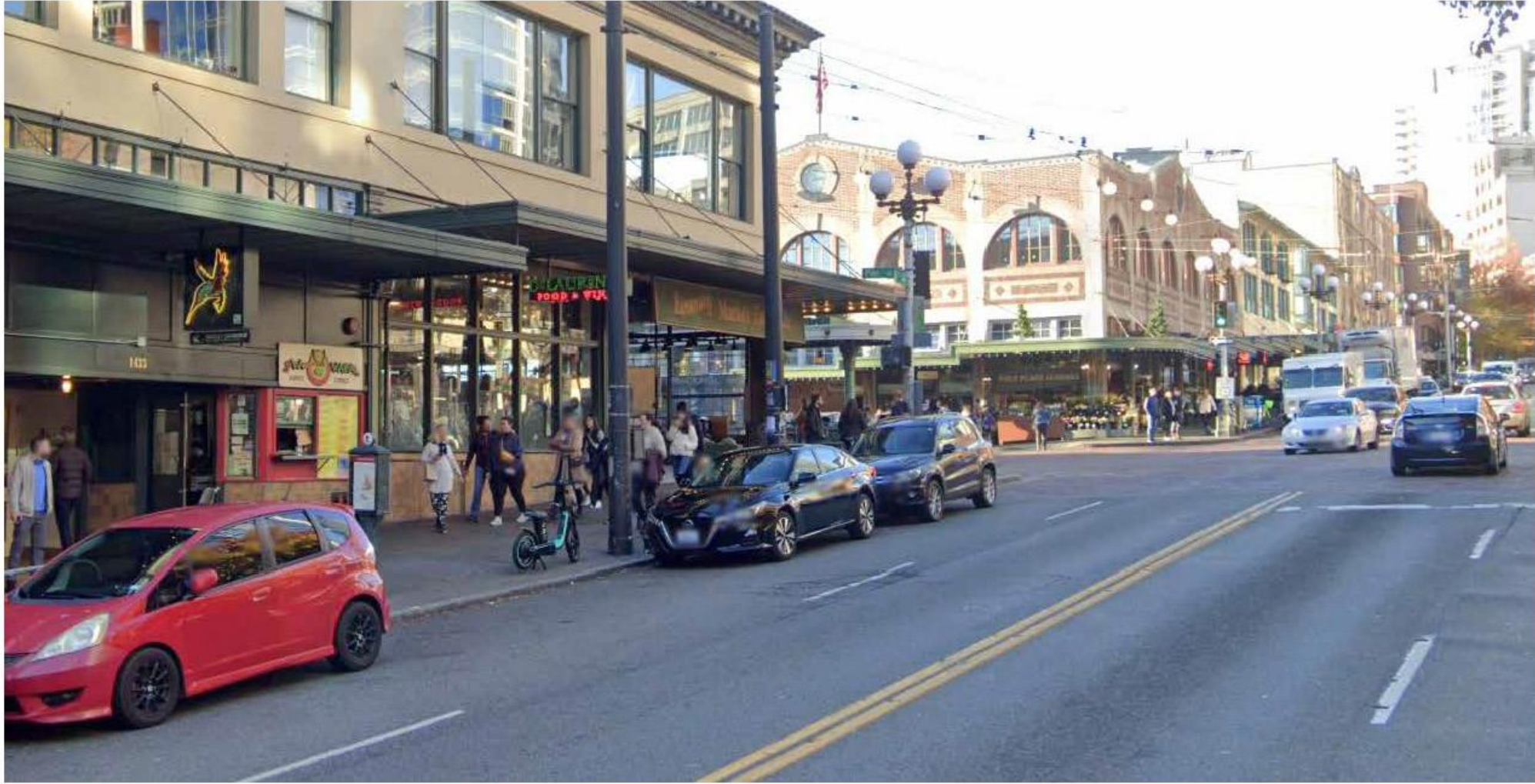
Pile Place Market Interpretation, March 3, 2023