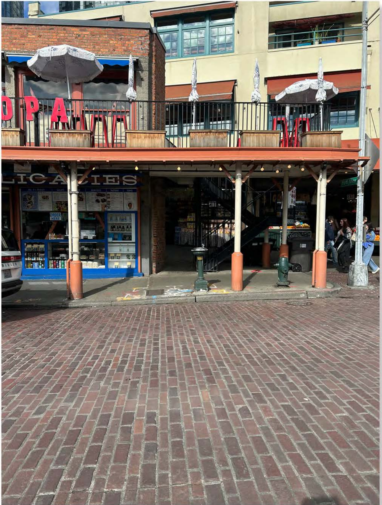
PICTURE OF FOUNTAIN FROM WEST TO EAST