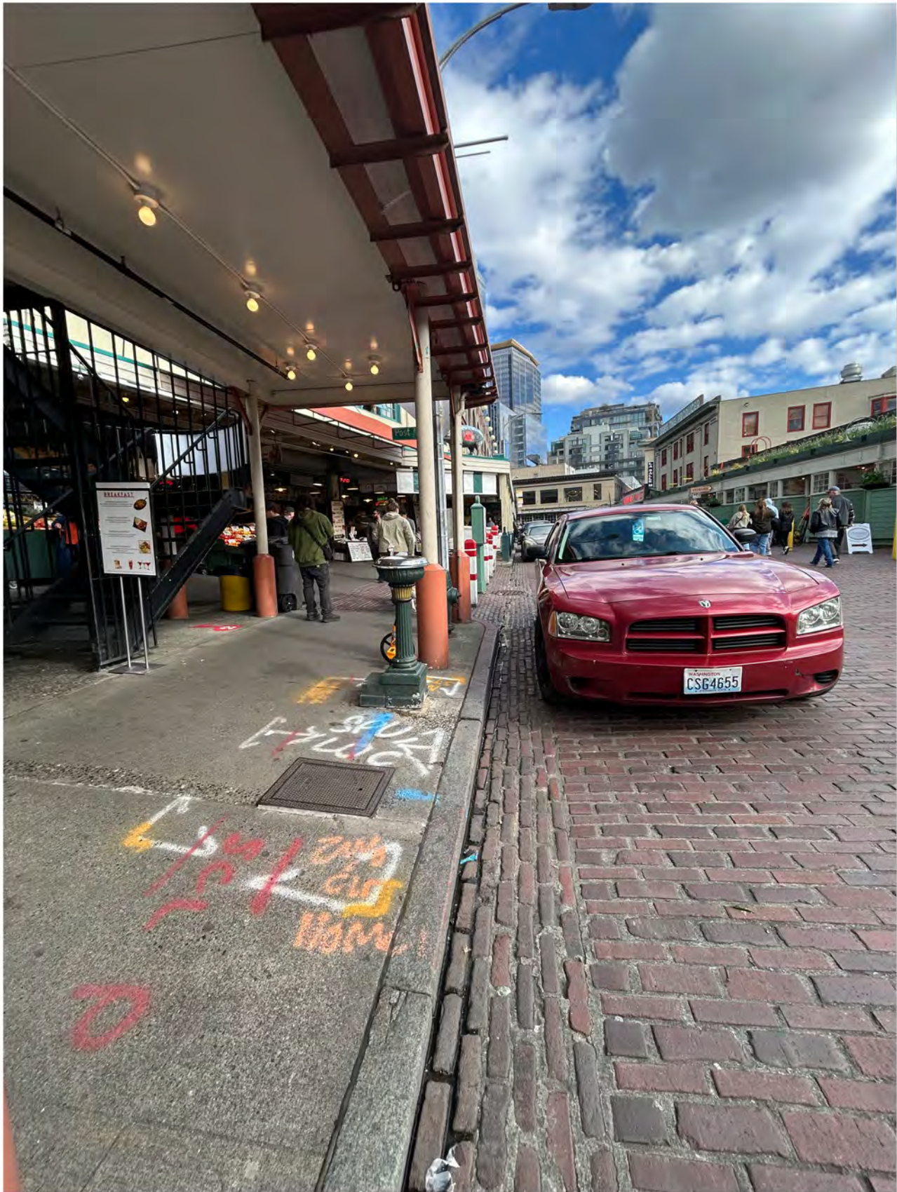
PICTURE OF FOUNTAIN FROM NORTH TO SOUTH