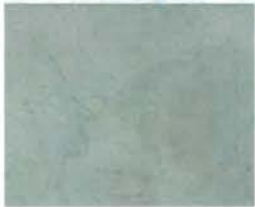
Stratus Blue Marble

Seating - George & Willy white flexible wall mounted standing tables installed on south wall - color white