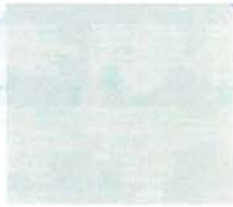
Ceaserstone Pure White Quartz