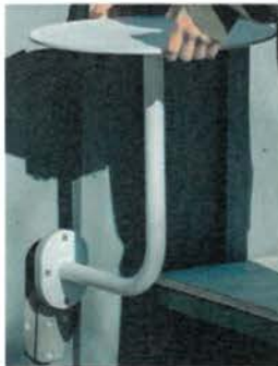
George & Willy wall mount table