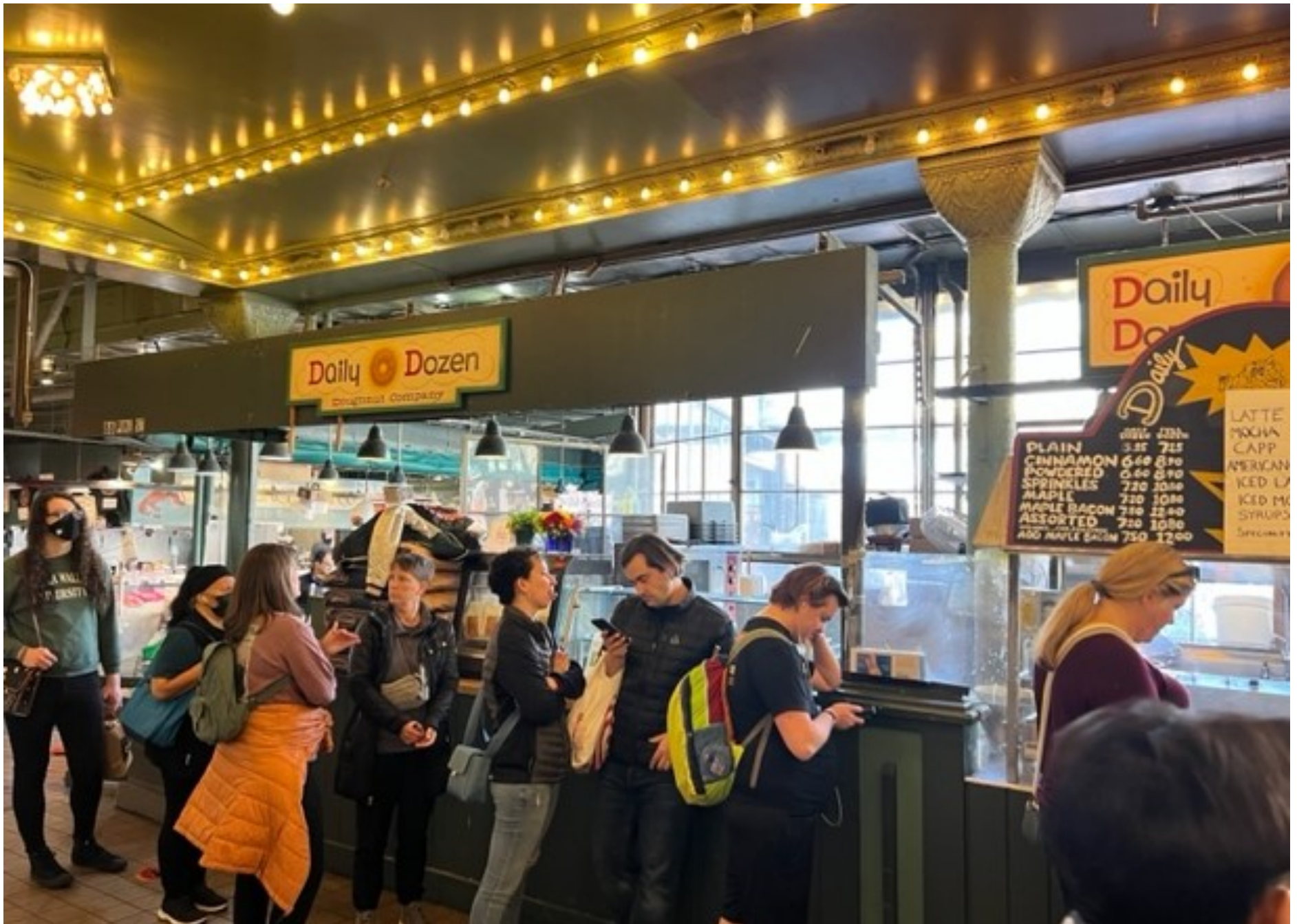
Photo of green lightbar over existing Market business