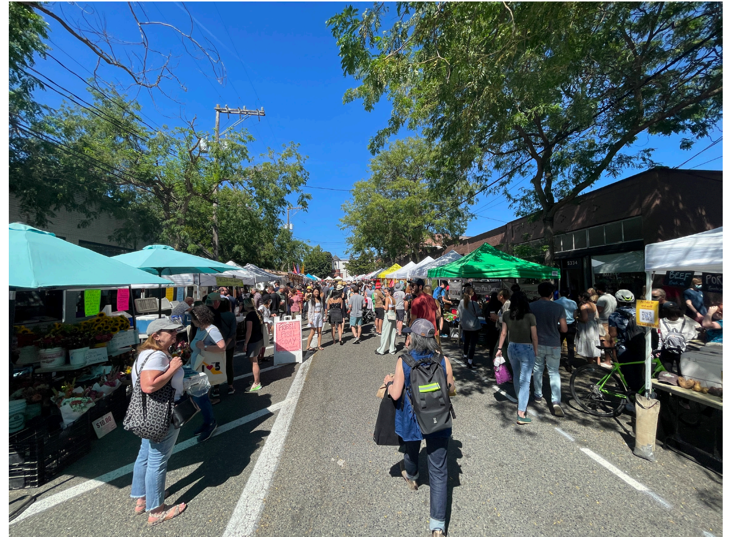
Existing - Market