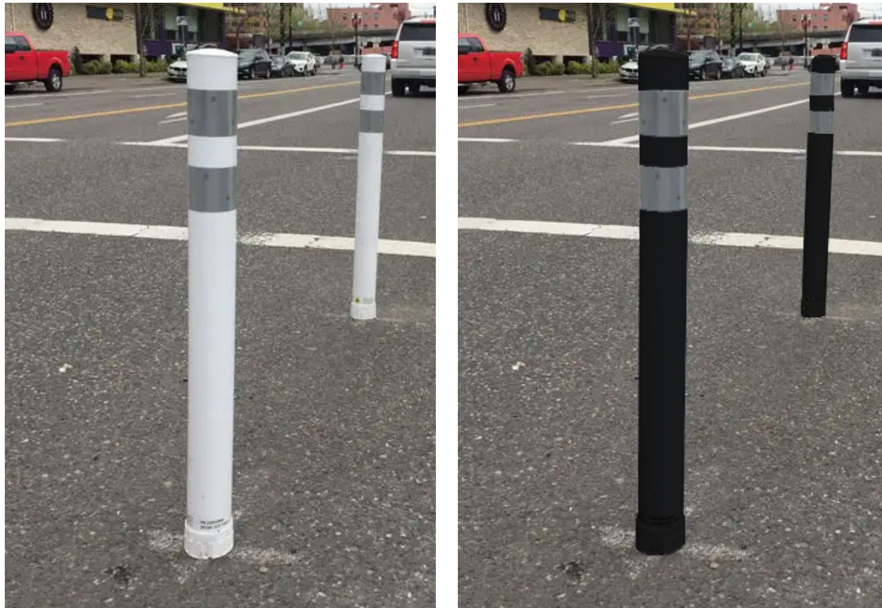
Removeable Flexible Delineator Post

Delineator Posts are removeable, leaving a flush surface, and come in black or white.