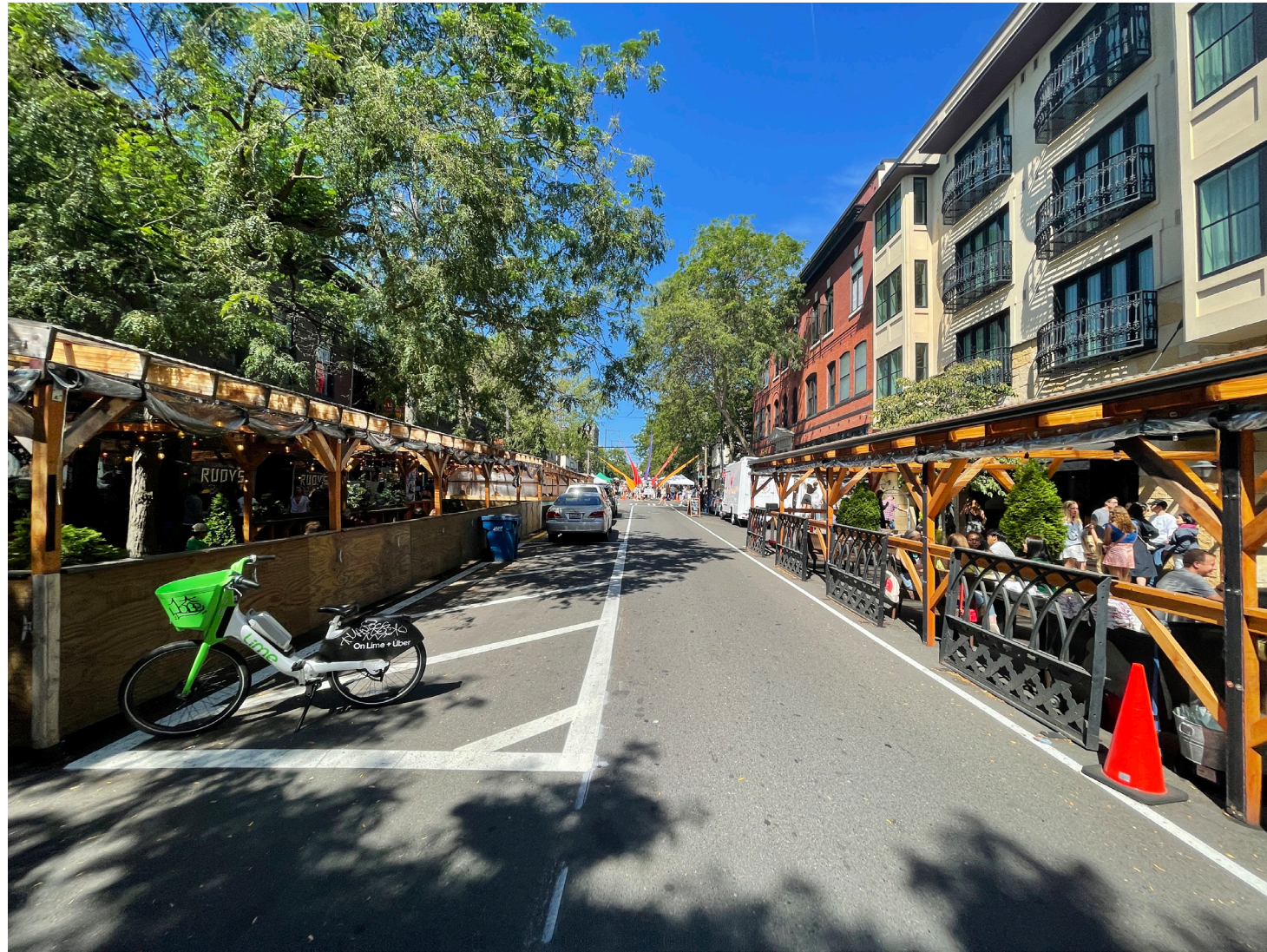
Existing - Everyday