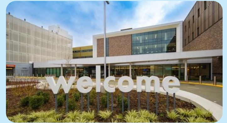
Updated Everett Medical Center opened June 3, 2025.