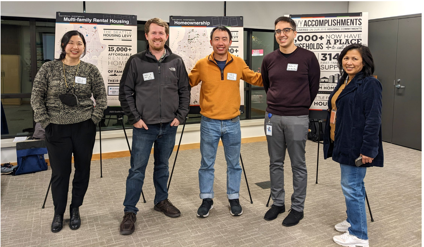
Housing Levy Open House at Hobson Place, December 6, 2022