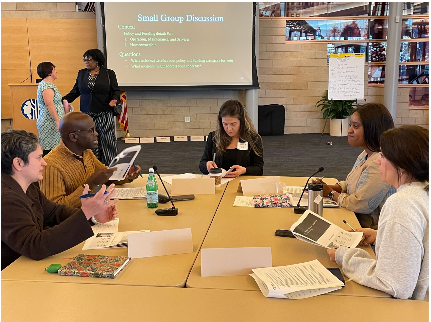
Housing Levy Technical Advisory Committee meeting, November 18, 2022