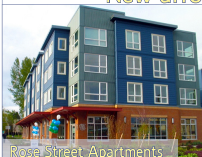
Rose Street Apartments