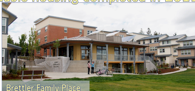
Brettler Family Place