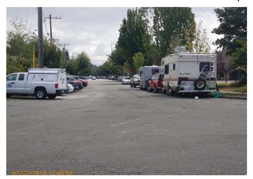
Exh A - Inspection Photos