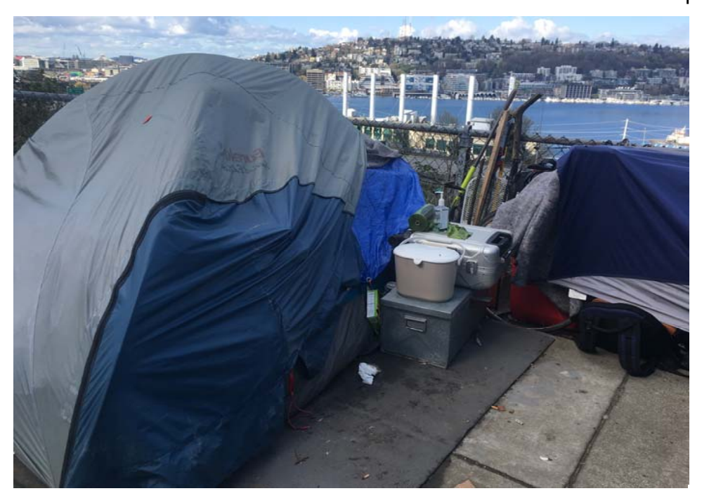
Exh A: Site Inspection Photos