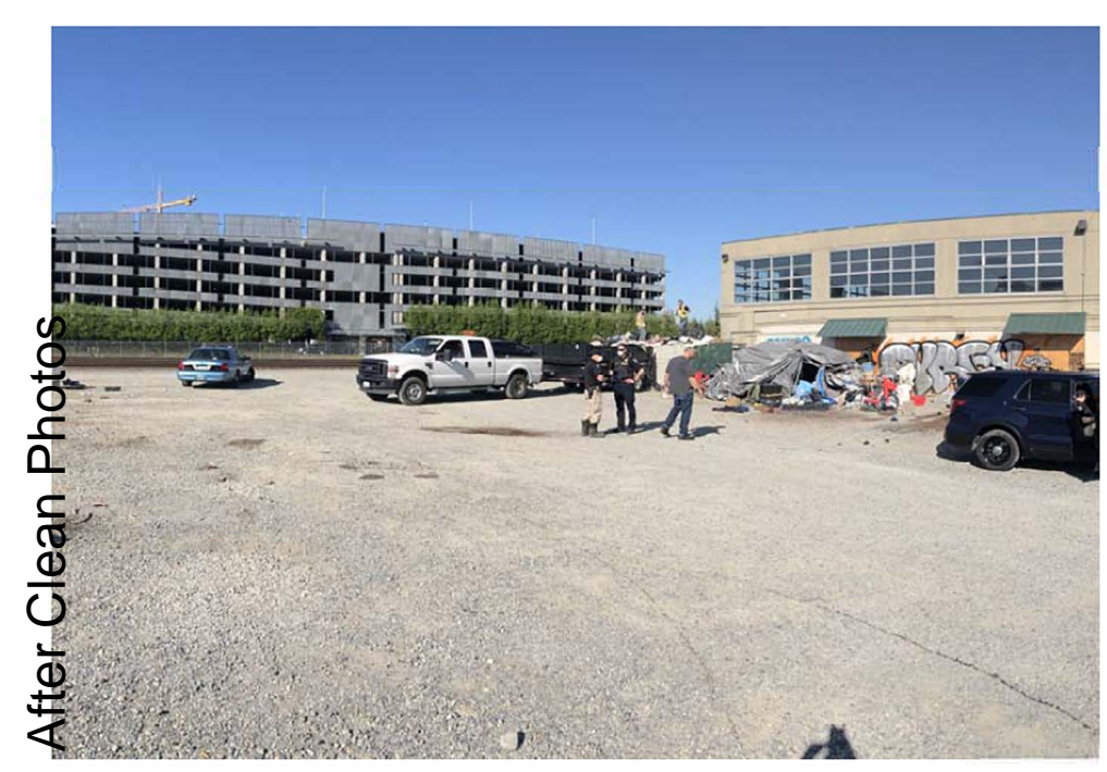
Exh D - Clean Up Photos