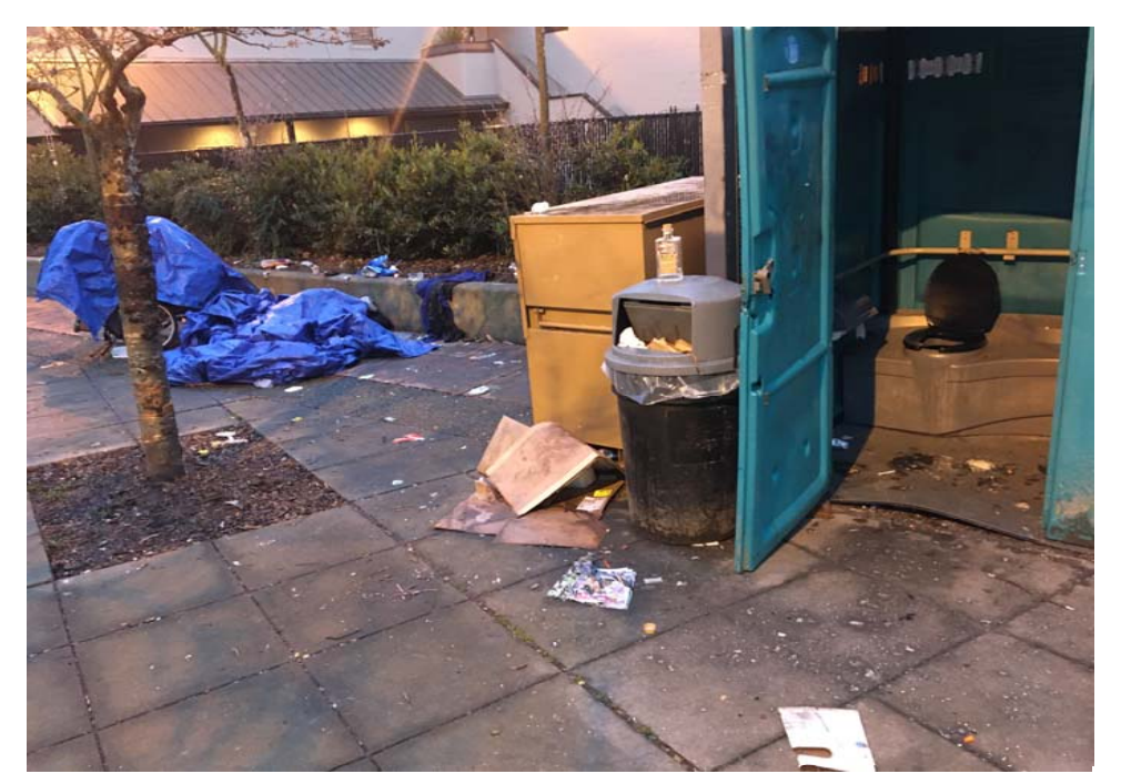
Exh D - Clean Up Photos