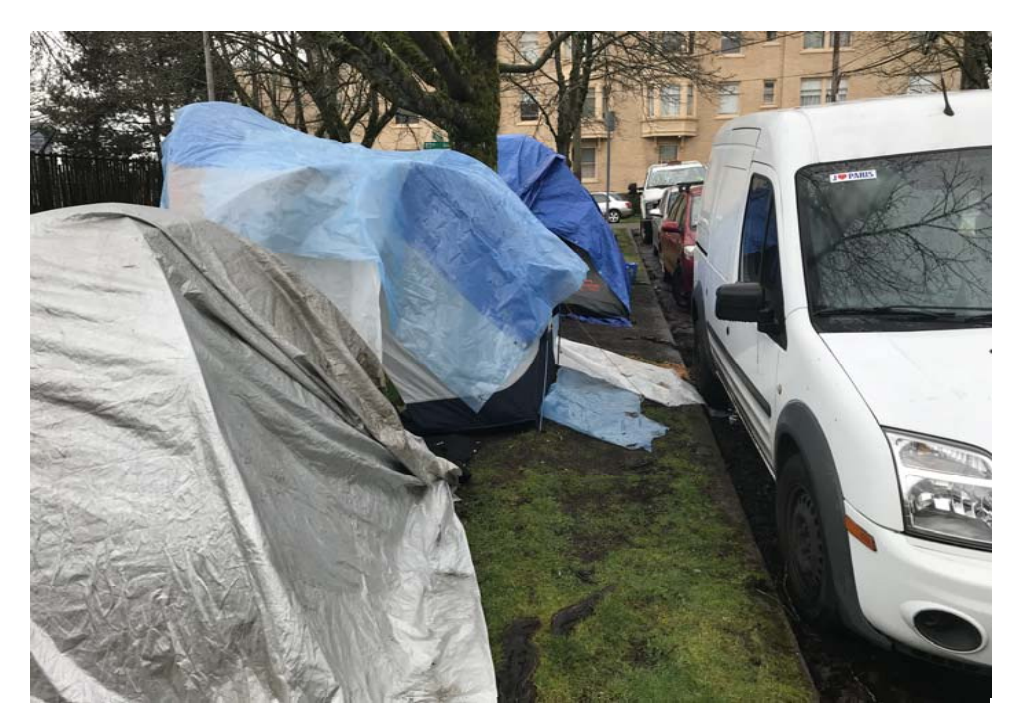
Exh D - Clean Up Photos