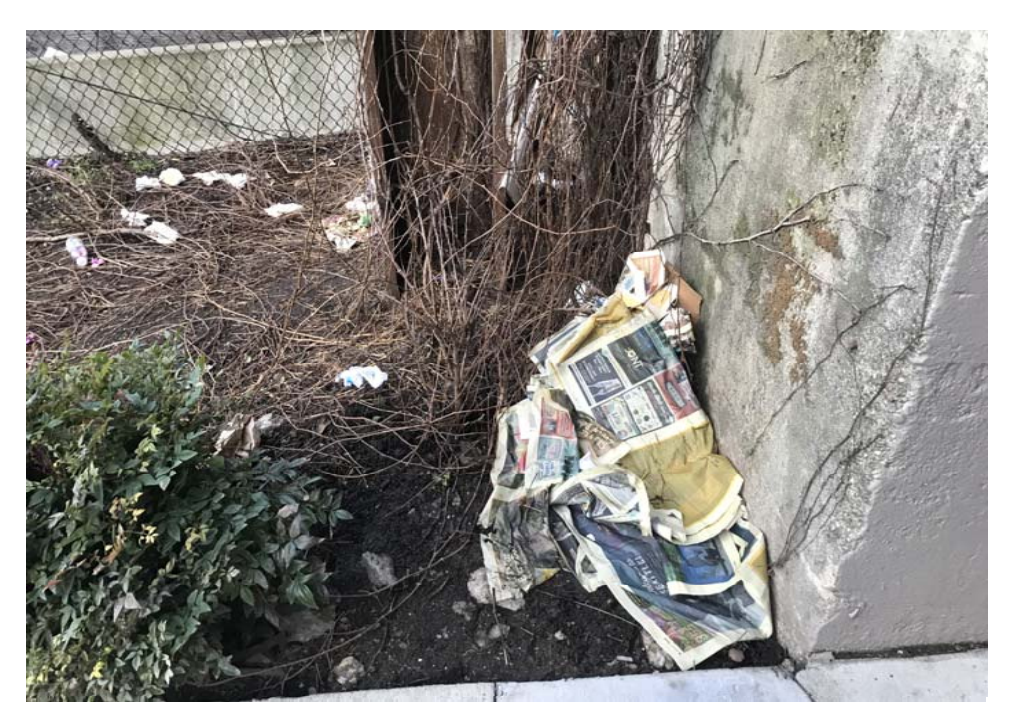
Exh D - Clean Up Photos