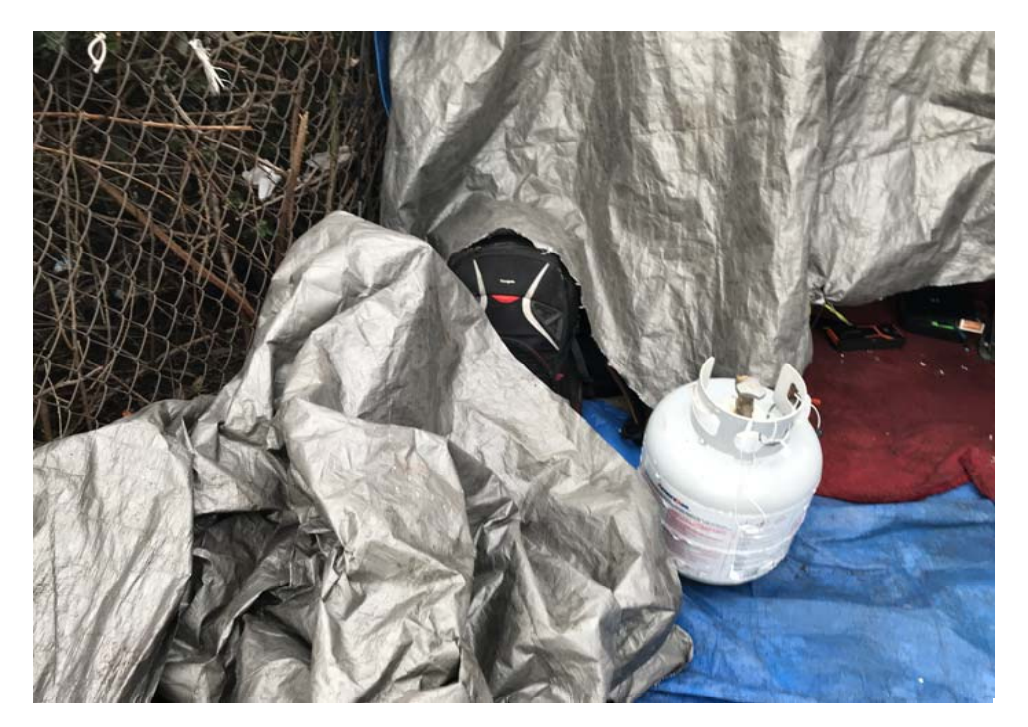
Exh D - Clean Up Photos