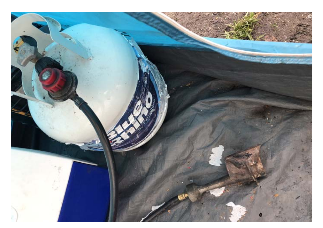
Exh D - Clean Up Photos