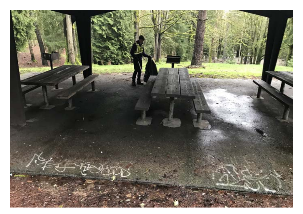
Exh D - Clean Up Photos