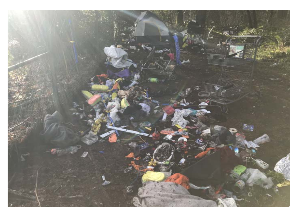
Exh D - Clean Up Photos