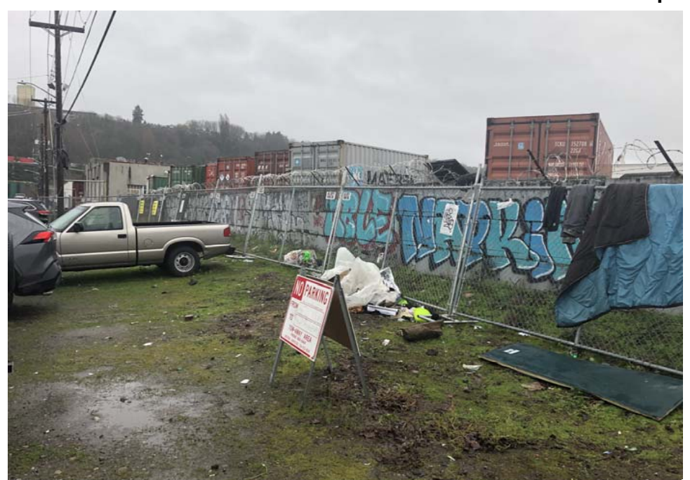
Exh A - Inspection Photos