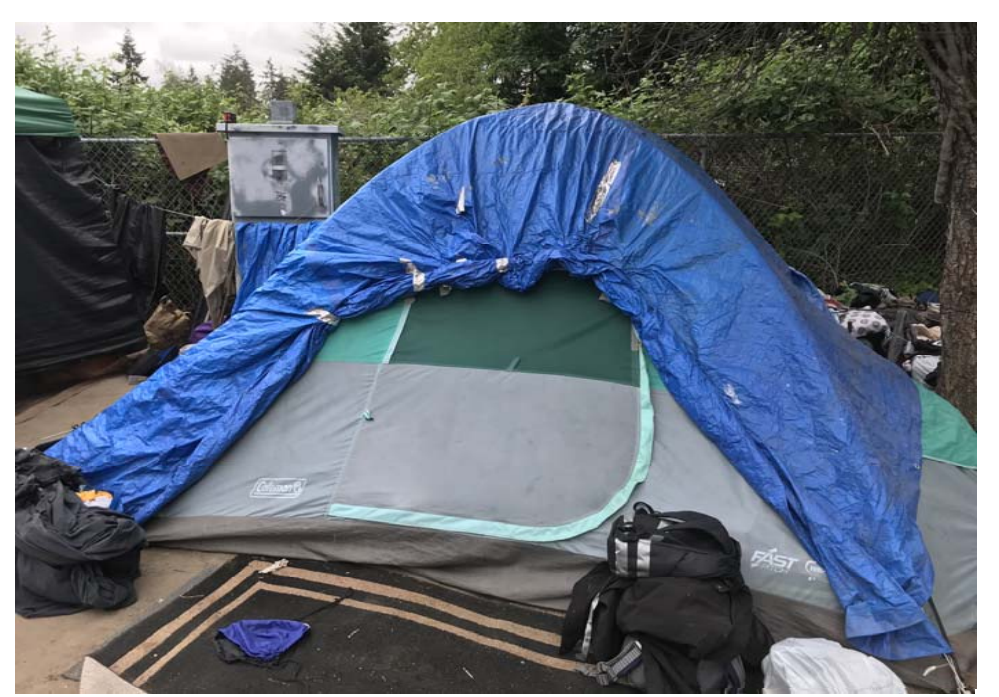
Exh A - Posting Photos