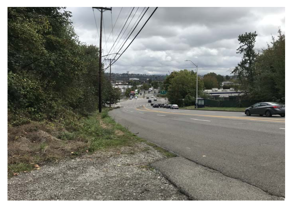
Exh A - Inspection Photos