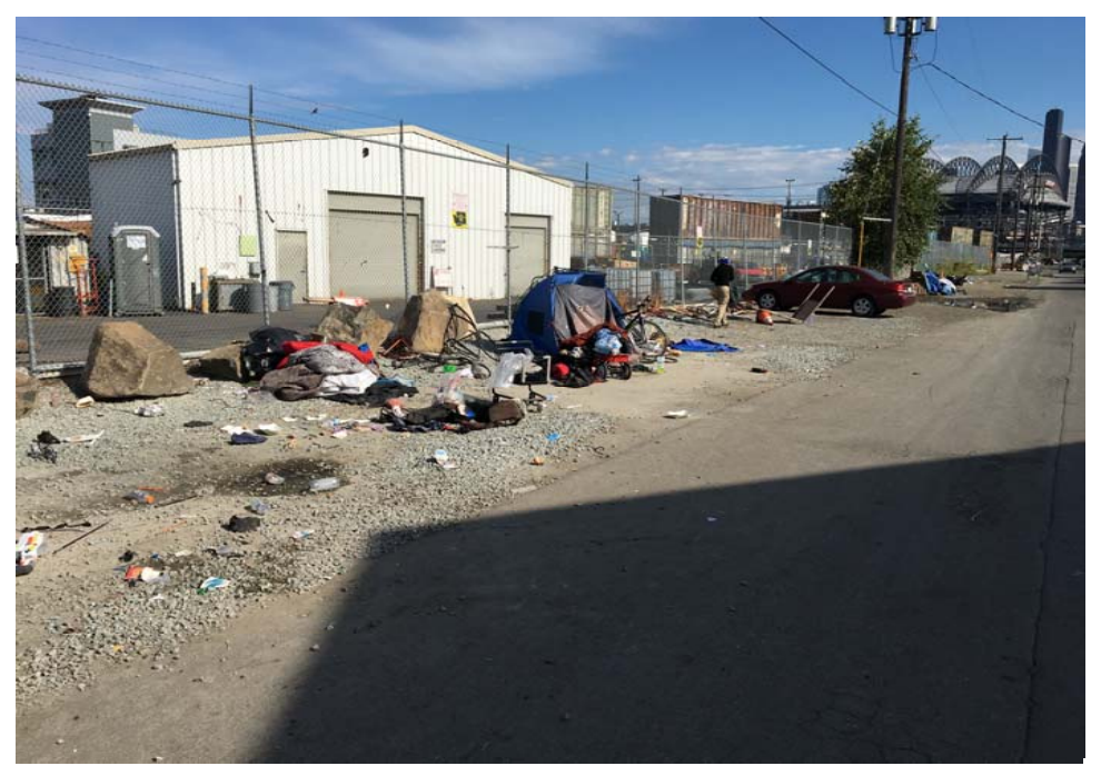
Exh D - Clean Up Photos