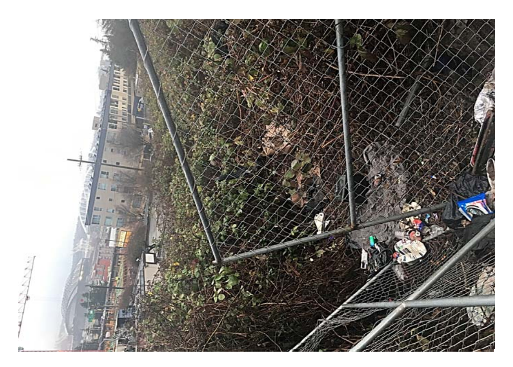
Exhibit A: Site Inspection