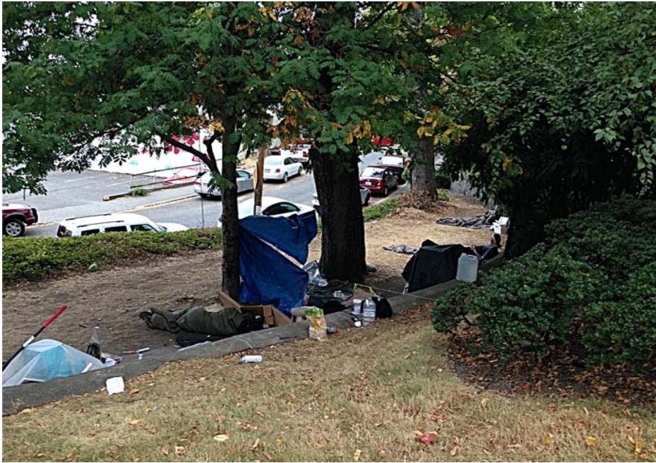
Exhibit A: Site Inspection