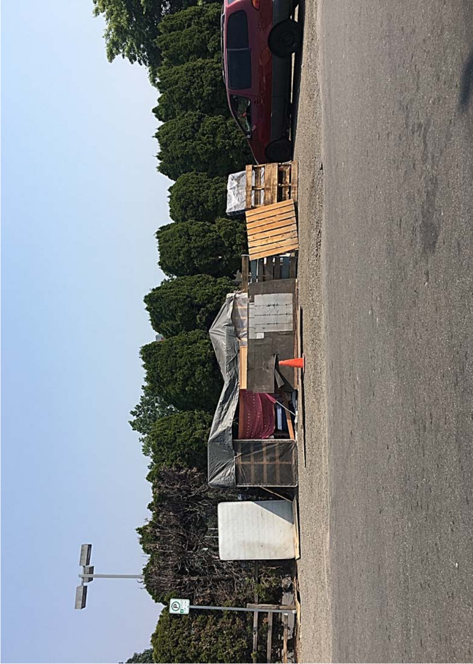
Exhibit A: Site Inspection