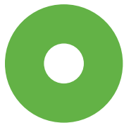
2024 Historical 1 Resource Mix