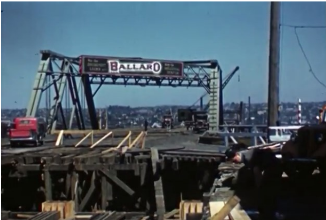
Construction and opening of the Ballard Bridge, 1940 Item 524

The most popular video on SMA's YouTube site this quarter is again the 1940 footage of the construction and reopening of the Ballard Bridge.