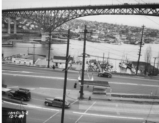
Nickerson Street, Dexter and Westlake Avenues, December, 1949. Item 54372, Record Series 2613-07, SMA

negatives, so that the original negatives are handled as little as possible, reducing damage. To date over 39,500 Engineering negatives have been scanned, cataloged and indexed, as well as over 16,000 SCL negatives.