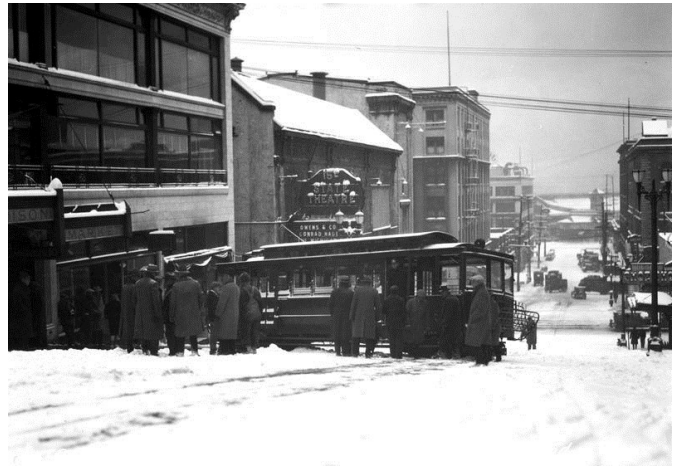
Madison Street streetcar derailing in snow between First and Second Avenues, January 28, 1929. Item 3258

KUOW used an image of streetcar troubles in the snow from 1929.