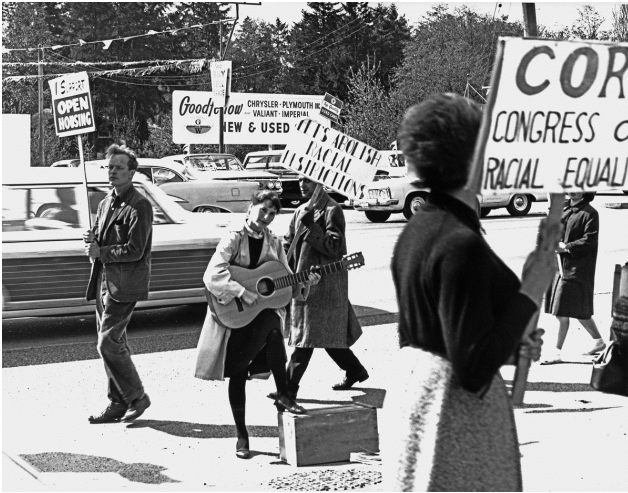
Open housing demonstration, May 4, 1964 Item 63911 , Seattle Municipal Archives

One of the most popular images on SMA's Flickr site is of a CORE-sponsored demonstration at the realty office of Picture Floor Plans, Inc. on May 4, 1964.