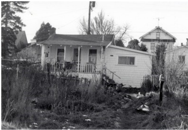
4417 37th Ave SW, January 18, 1977. Item 179066 . Record Series 1629-02, SMA

The West Seattle portion of the Neighborhood Architecture Photographs and Surveys are now available online. Most of the images date from 1975 to 1977. The inventory was administered by the Historic Seattle Preservation and Development Authority with funds from the National Endowment for the Humanities and the City of Seattle. In a bicentennial effort, volunteers surveyed selected neighborhoods; inventory forms were reviewed by consultants Folke Nyberg and Victor Steinbrueck and resulted in neighborhood inventories still available through Historic Seattle. Survey maps accompany the images, although these are not available online.