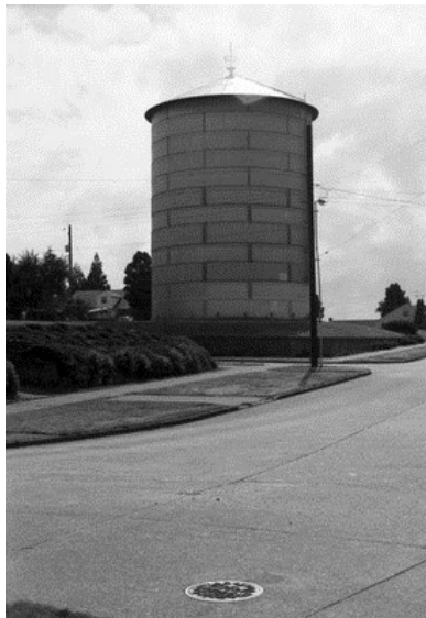
Water tower, 39th Ave SW & SW Charleston St., June 24, 1976 Item 179425 . Record Series 1629-02, SMA

Over 600 black and white images with identifiable addresses are available online . West Seattle is the first neighborhood to be completed; Ballard is next.