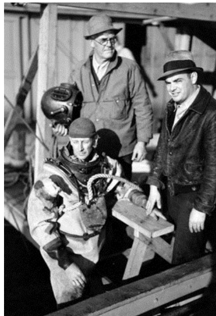
Setting up dredging machinery at Green Lake, November 30, 1935. Item 180872 . Record Series 2625-10, SMA.