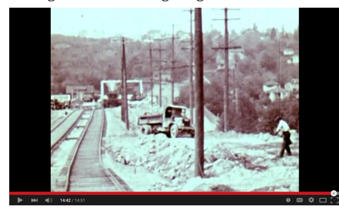
Spokane Street construction, 1928 Item 434

SMA's YouTube channel has over 115 videos and over 200 subscribers. One of the most popular items is Part 1 of "Seattle: Picture of a Young City." Created in 1976 by the Seattle Engineering Department, the film depicts notable events and public works construction in Seattle history through still and moving images.