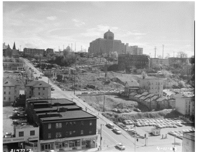
Freeway progress along 6th Avenue from top of Municipal building, April 11, 1963

As scanning of Engineering Department negatives works its way through 1963, images are appearing online of construction of the I-5 freeway.