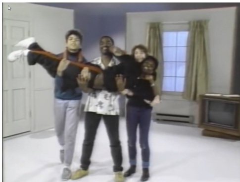
"Reduce Your Chills," 1987.