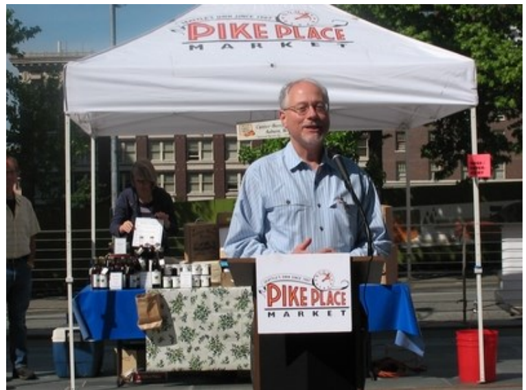
Councilmember Conlin speaking at the opening of the City Hall Plaza Farmers Market, June 23, 2009.