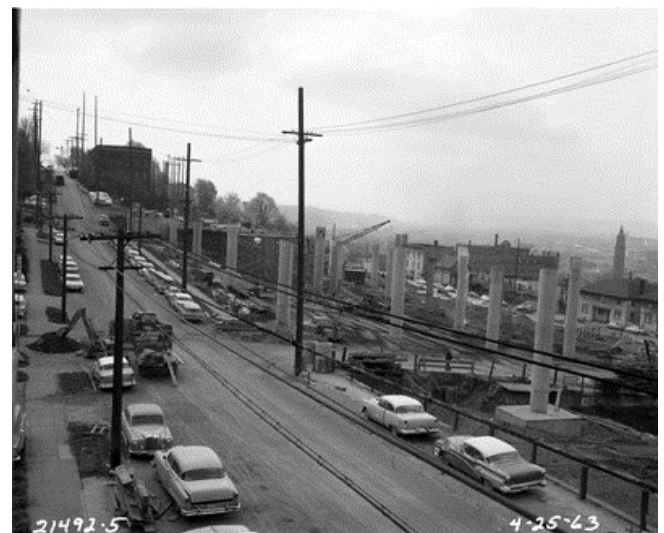
Construction of freeway overpass on James Street between 6th and 7th Avenues, April 25, 1963