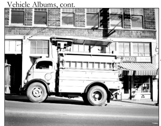
Signal Tower Truck, October 8, 1948 Item 47480