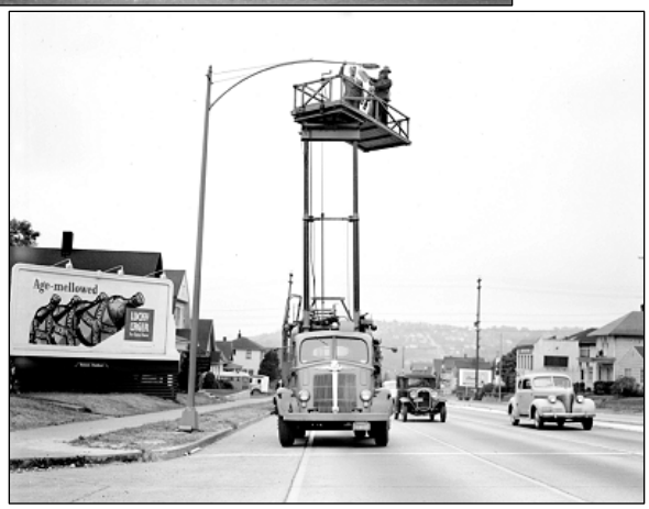
Tower truck in operation, August 10, 1949. Item No. 41894

The images are all accessible from the Archives homepage by searching the Series ID "2613-20" in the "Search Photos" box. The photo album pages with identifying information can be viewed by visiting the Archives reference room.