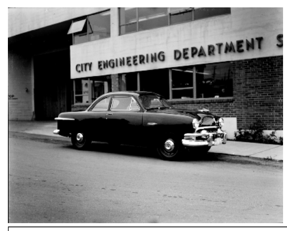
Vehicle in front of Engineering Department offices, November 10, 1951. Item 59322

In order to perform their varied duties, the Engineering Department relied on a fleet of vehicles and equipment. The Archives cataloged the contents of three photo albums containing an inventory dating from 1920 to 1952.