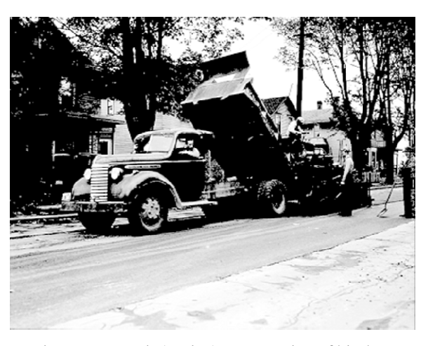
23rd Avenue South (paving) center strips of black top operations, September 16, 1941. Item 39953

When they needed a little more trunk space they pulled out the 1940 GMC 2 Ton Dump Truck. It had a 6-cylinder motor and