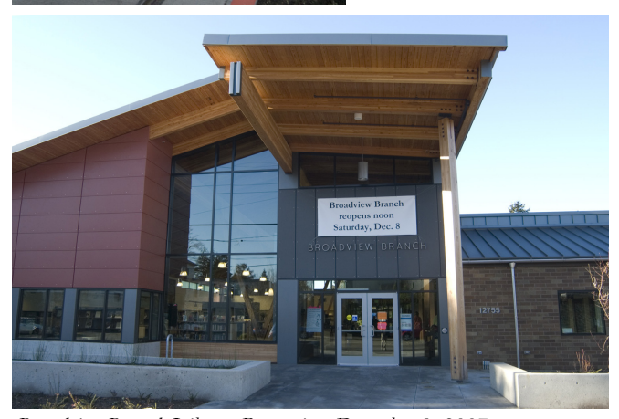
Broadview Branch Library Reopening, December 8, 2007 Item 157118