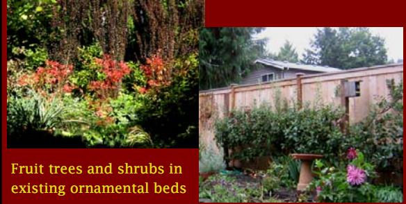
Fruit trees and shrubs in existing ornamental beds

Framed raised beds can be a great option, but there are many others: