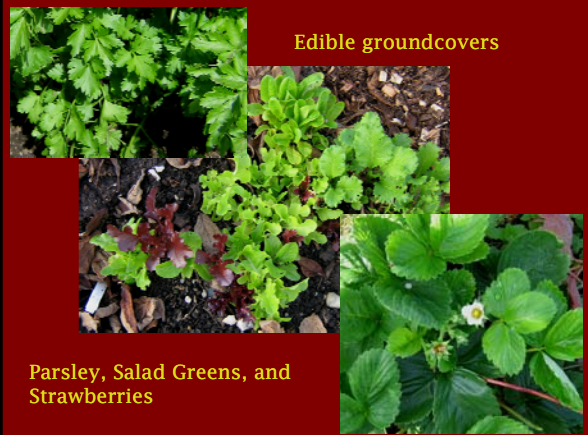
Parsley, Salad Greens, and Strawberries

Make sure to match water needs when adding edibles to an existing landscape.