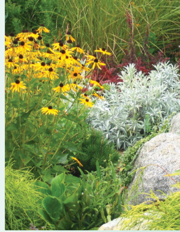
Waterwise Garden by Crooks Garden Design