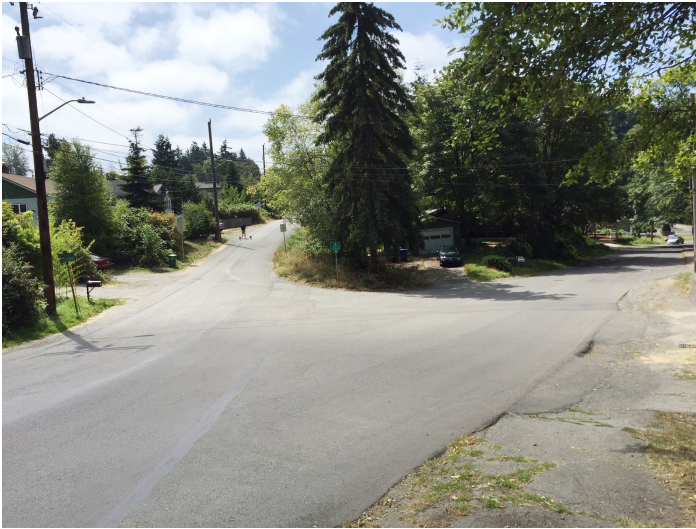
Existing conditions looking southwest on 18th Ave SW and SW Orchard St