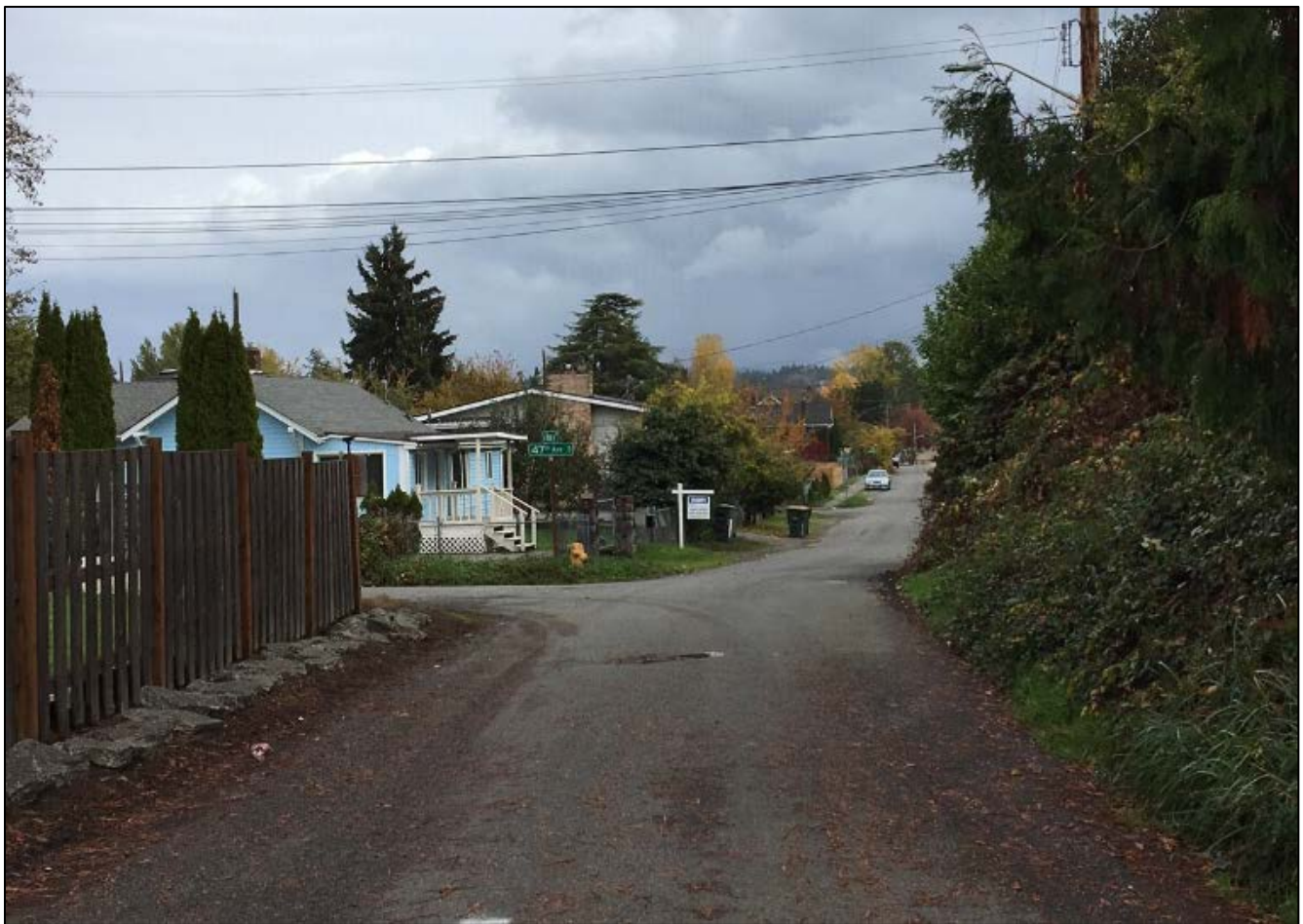
Photo of existing street (S Rose St between 46th Ave S and 48th Ave S)